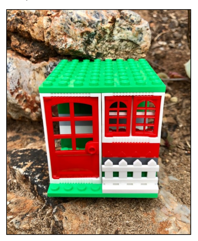
Figure 3 Carol's photovoice submission

In the accompanying reflective group conversation Carol stated,