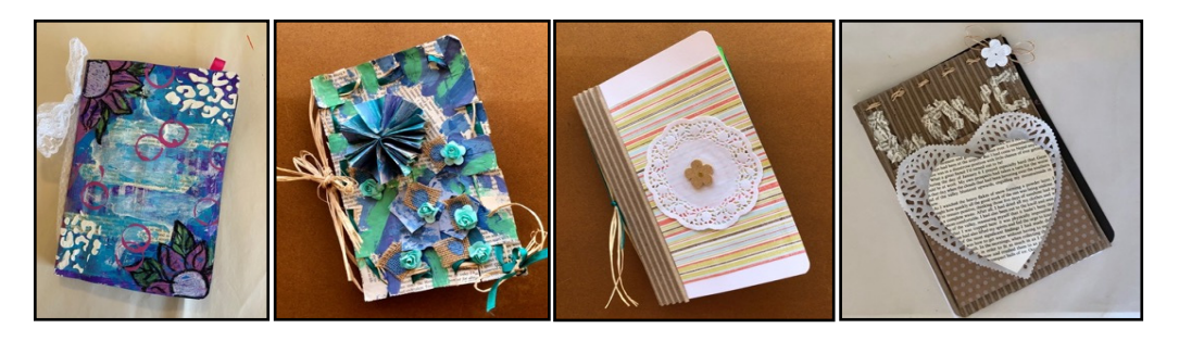
Figure 4 Cover pages of Reflective Journals

These journals were reflexive rather than just reflective since participants not only reflected on their thoughts and actions, but also pragmatically considered the context in which these actions occurred and actively engaged in facilitating change and growth. During this shared time of art-making, they were guided in reflecting on their learning together and on conceptualising strategies for addressing the barriers they all faced.