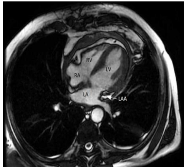
Fig. 2. Cardiac MRI showing heterogeneous thickening of pericardium, normal LAA.