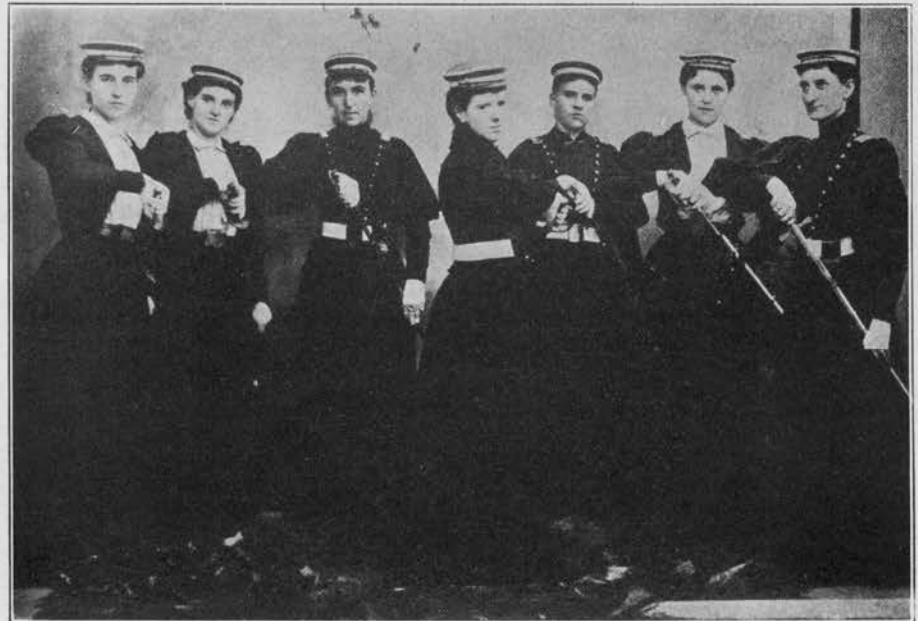
The Ladies' Battalion goes to the World's Fair.