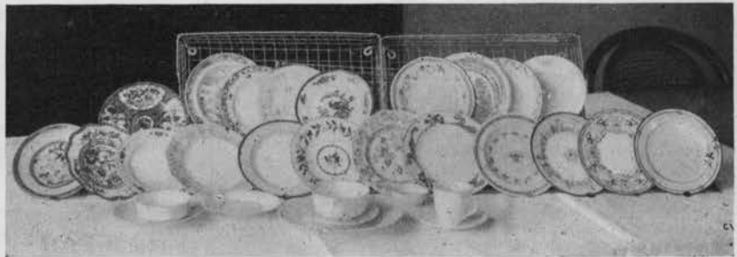
Good Looking China Adds Charm to a Meal.

advantage, it is well to know something about the kinds of ware, varieties of patterns and the many qualities found on the market.