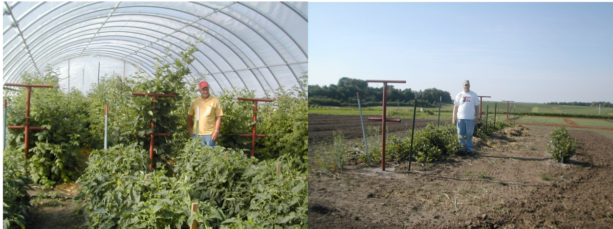
Figure 3. Brambles being grown in the high tunnel and outdoors at the ISU Armstrong Research Farm photographed in mid-June to show differences in cane development.