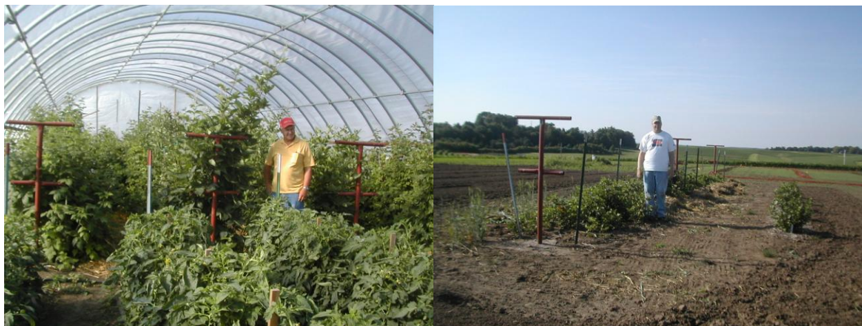
Figure 3. Brambles being grown in the high tunnel and outdoors in mid-June at the ISU Armstrong Research Farm.