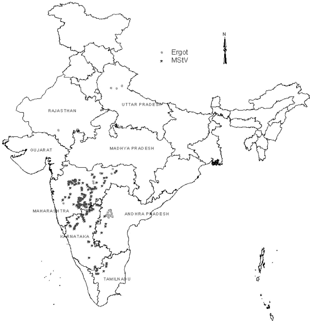
Figure 2. (b). Prevalence of ergot and maize stripe virus of sorghum (MStV) in Deccan region's states of India surveyed from August 2000 to March 2001.

(Figures 3c, 3d and 3e), and excessive tillering (Figure 3f). The MStV symptoms observed were similar to those described by Peterschmitt et al. (1991). The transmission of MStV is by the vector, viruliferous adults (Figure 3g) of the delphacid plant hopper ( P. maidis ).