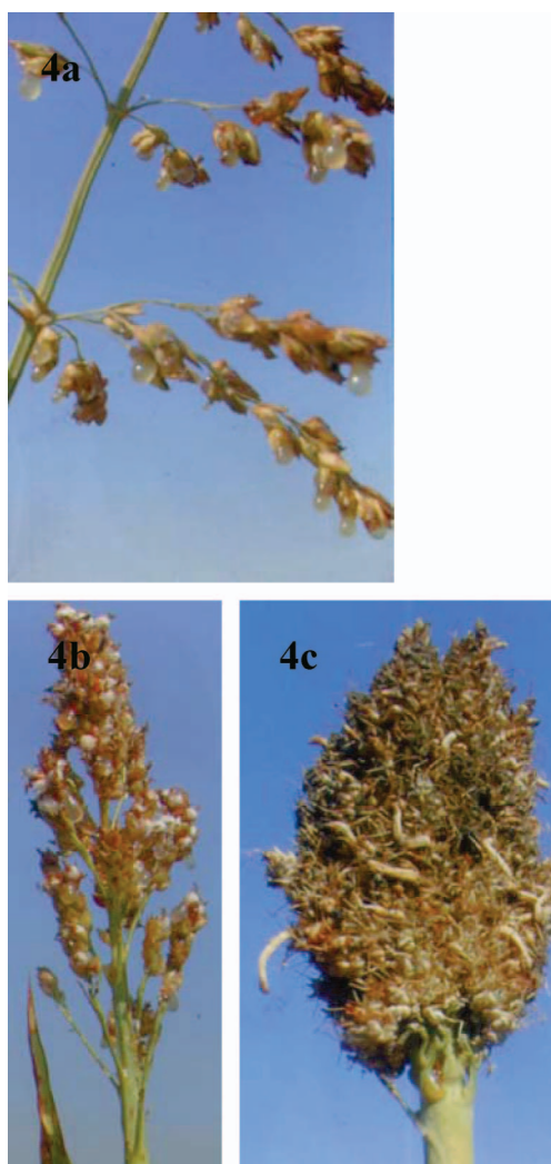
Figure 4. Symptoms of sorghum ergot. a=panicle with yellow brown to pink colored honeydew symptoms. b=panicle with superficial white mat. c=panicle with sclerotial symptoms.

Out of five panicle diseases observed, the percentage of fields with ergot was more predominant than smuts. However, less attention was paid towards grain mold because of its complex etiology and widespread damage during the rainy season. Of the 202 fields surveyed in Andhra Pradesh, 30.7% had ergot; similarly the values in Karnataka, Maharashtra and TN were 9.6%, 11% and 2.4%, respectively.