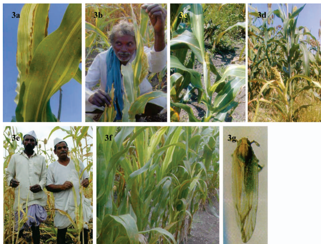
Figure 3. Symptoms of maize stripe virus (MStV) of sorghum. a = Chlorotic stripes and interveinal bands on leaves. b = A farmer viewing chlorotic stripes of MStV. c = MStV infected plant with stunted growth and reduced panicle exertion. d = Comparison of MStV infected plant with stunted growth and reduced panicle exertion and healthy plants. e = Farmers holding stunted plants of MStV and healthy plants in the back. f = Excessive tillering in MStV infected plant. g = MStV transmitting agent the delphacid plant hopper.

of fields with MStV was 28.3%, followed by leaf blight (14.3%), rust (9.4%) and sooty stripe (3.9%). One of the important quarantine diseases observed in Karnataka was bacterial leaf streak (Navi et al. 2002b). MStV was observed most commonly on both local cultivars and hybrids grown either for food or fodder purposes. Near Bellary (15°08'N; 76°58'E) in Karnataka, the MStV incidence was from 30–50% with up to 70% severity in late infected plants and 100% in early-infected plants. A Bellary farmer, who continues to produce sorghum seed for the last seven years, said MStV reduced 0.75 t ha -1 yields in 2000. Members of seed producers association in the area said MStV damaged nearly 55 ha sorghum area where hybrid seeds were being produced for one of the leading seed companies. Another observation from a farmer of Dummi village [14°01'N; 76°04'E) in Chitradurga district considered MStV more dangerous than other diseases.