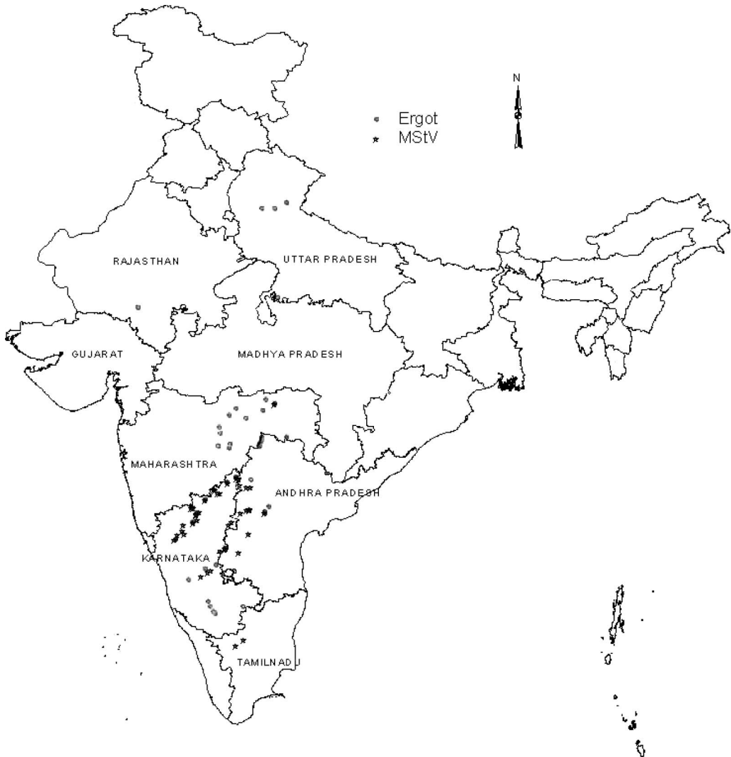
Figure 2. (a). Prevalence of ergot and maize stripe virus of sorghum (MStV) in Deccan region's states of India surveyed from August 1999 to February 2000.