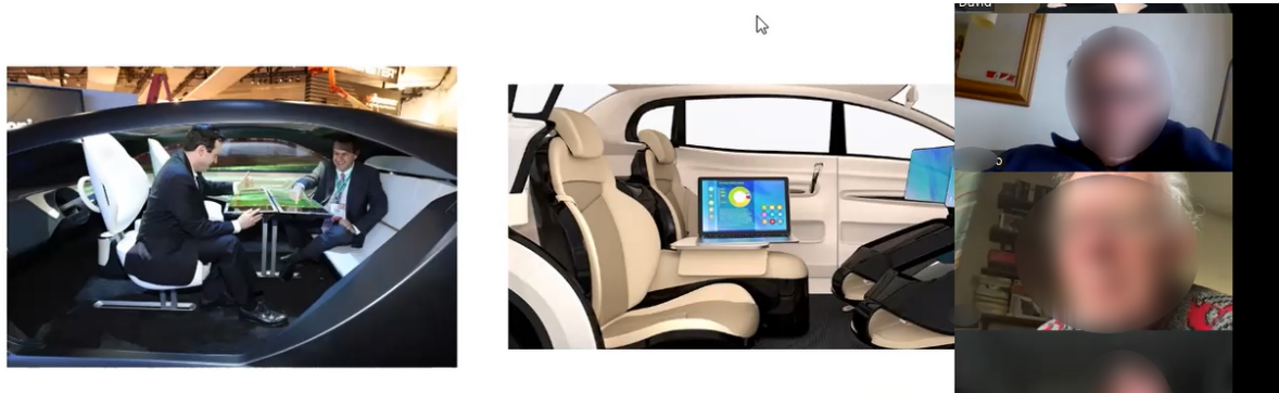
Figure 1: Participants from the age group 60-65 discussing non driving related tasks while shown images of an interior of future AVs (Left image: [26]. Right image [14].)

stephen.brewster@glasgow.ac.uk University of Glasgow Glasgow, United Kingdom