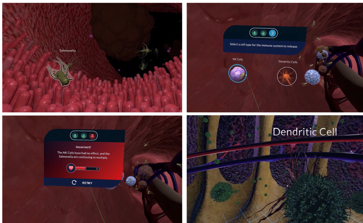
Figure 1: Screenshots from the Battling Infection Virtual Reality (VR) simulation. Students enter the VR simulation in the small intestine, where they encounter a Salmonella infection. They must then travel through the body, interacting with immune cells and selecting the appropriate immune response to combat the infection.