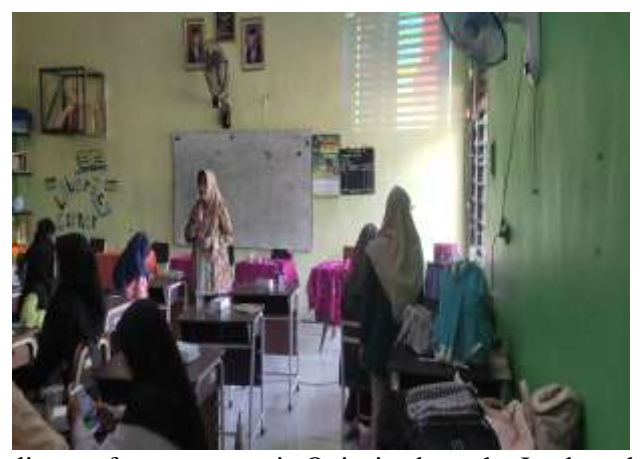
Figure 3. Delivery of assessment via Quizziz about the Jamboard application

Figure 2 indicates the delivery of material during Jamboard workshop in a class at SMP PGRI 6 Surabaya, where space was quite limited, but the participants looked enthusiastic and eager to take part in the workshop.