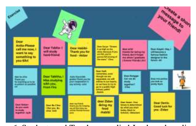
Figure 6. Students and Teachers applied Jamboard application

2. Technology mastery of students and teachers at SMP PGRI 6 Surabaya was increased After collecting the questionnaire on workshop needs in technology-based English language learning and it was obtained that the students, the teachers and the principal stated that they really needed the workshop, the team carried out the workshop about using Jamboard in teaching English on 27 July 2023 at 09.00-end. In the workshop, team observed that the technology mastery of students and teachers at SMP PGRI 6 Surabaya was increased, from low-high. At the beginning, the students and the teachers looked very confused and did not know how to implement Jamboard application, even they did not know about this application. After they were taught how to implement Jamboard, they were easy to implement it and wrote about a short message to their friend in the Jamboard. It could be seen in the figure below: