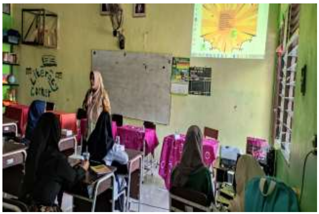
Figure 2. Workshop of Using the Jamboard Application

Figure 2 indicates the delivery of material during Jamboard workshop in a class at SMP PGRI 6 Surabaya, where space was quite limited, but the participants looked enthusiastic and eager to take part in the workshop.