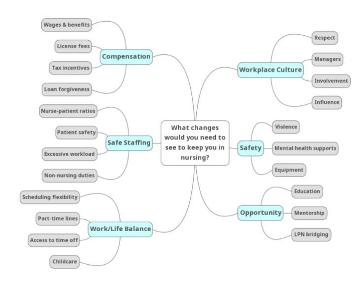
Figure 2. Changes Needed-Subthemes