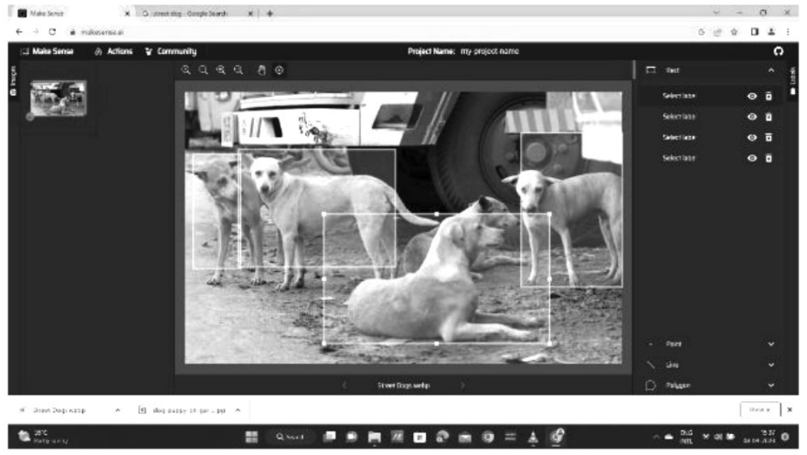
Fig.2 Data Training

in the image. This can be a time-consuming operation that may necessitate the assistance of human annotators. Several annotation tools are available to help you speed this process and generate high-quality annotations. After annotating the dataset, it may be used to train the YOLOv3 algorithm. During the training phase, the algorithm is presented with a huge number of photos and their related annotations. The program me then makes adjustments to its parameters in order to reduce the distance between its predictions and the groundtruth annotations. Given how different animals may be in look and behavior, training a YOLOv3 model on an animal dataset can be difficult. The dataset's quality, the animal classes' complexity, and the quantity of training data available will all affect the model's performance. To increase the variety of the training data and strengthen the resilience of the model, it could be required to apply data augmentation techniques such random cropping, flipping, or rotation. It might be difficult yet rewarding to build and train an animal dataset for YOLOv3. It is feasible to develop a model that can precisely recognize and locate animals in photos with the use of a high-quality dataset and careful tweaking of the model's hyperparameters