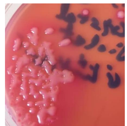
Figure 2. Colonies growths of R. terrigena on MacConkey agar.