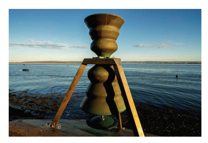
Fig. 1 Appledore Time and Tide Bell. Artist: Marcus Vergette

Arts and humanities-based approaches offer unique opportunities to facilitate dialogue creation. Creative workshops offer an approachable way for communities to engage in academic research. At the same time, creative practices, especially handwork (such as sewing, knitting and crafting), can offer space for difficult conversations about sea level rise, coastal erosion and loss, particularly when they draw upon placebased and historically informed stories, which make big stories of global change more relevant and legible at the local scale. For 'Risky Cities' and 'CLandage', intensive programmes of archival recovery [15, 16] fed into creative workshops, offering opportunities for participants to work with archival materials, maps and material objects while sharing their experiences of weather, climate and flood. 'Risky Cities' recovered an 800year history of living with water and flood in Hull and the surrounding region, using these resources to inform a series of place-based, historically informed arts events (see the discussion of FloodLights below) and a community engagement programme involving textile and creative writing