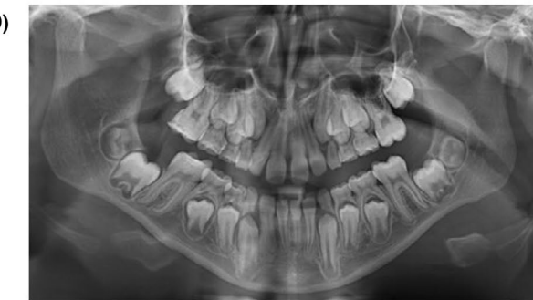
FIGURE 2 Clinical photographs and radiographs of systemically healthy control patient diagnosed with gingivitis (A,B) and periodontal health (C,D)