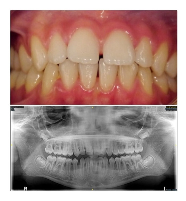
FIGURE 1 Clinical photograph and radiograph of neutropenic test patient diagnosed with periodontitis

(as part of the normal exfoliation process) and 46 additional permanent teeth erupted enough to be probed during the study 6-month follow-up period. Table 2 shows periodontal parameters at baseline