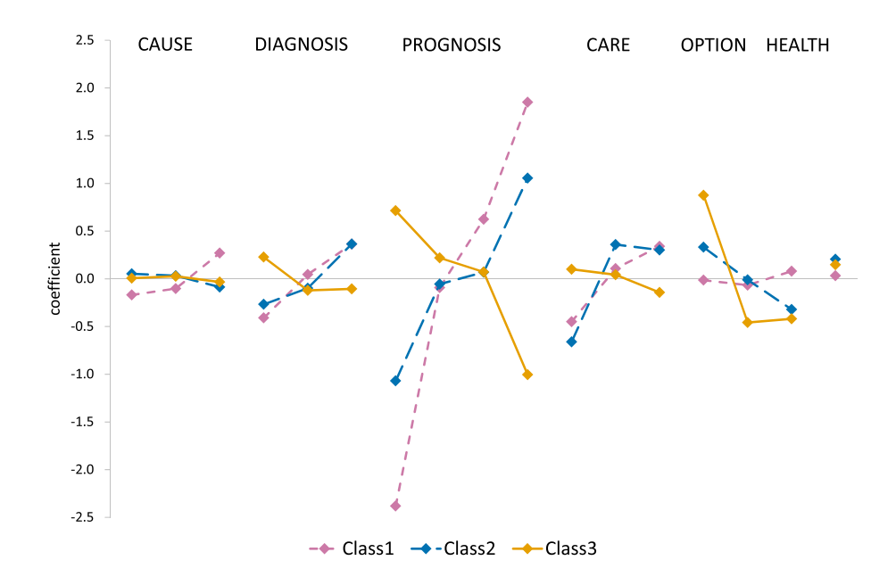
Fig. 2 Results of the latent class analysis for three classes of the five-class solution. For each attribute (names at the top of the figure), the regression coefficients for each class are plotted with the levels of all attributes ordered from worst to best as in the preceding tables. The points for each class are joined by a line to show the effect on choices; an upward (downward) sloping line indicates that respondents in this class were more likely to choose to treat a condition that had the better (worse) level of this attribute. Classes 4 and 5 are omitted for clarity.

The strength of preference to fund a new treatment for a condition that is curable with current treatment, and of the aversion to choosing an end-of-life treatment, is perhaps unexpected. In particular, the estimate of 15 additional