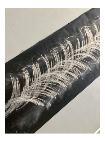
Residency image - moving with chalk. Image: dancer 'C'.

encapsulates the aesthetic of the whole project really in the way it unfolds and opens and the weight reveals the stories in kind of different ways and the simplicity and the stripped back nature of it, but also the texture of the fabric and it's the care that's been put into it and the hand maintenance of it.' A range of ways to engage with performance materials encourages the audience in taking time to engage with sensory qualities, that convey the restful ideas in the work, as well as increasing accessibility.