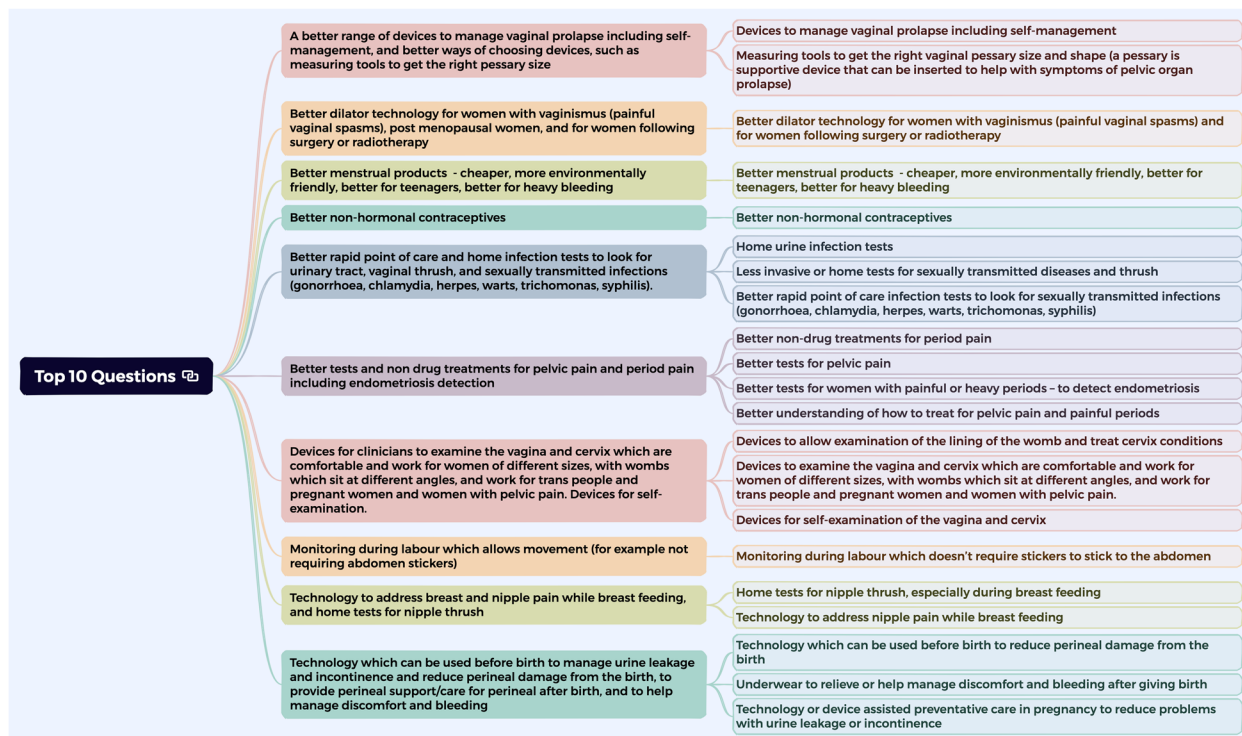
Fig. 3 Graphical representation of the top 10 priorities identified, showing the 21 unmet needs that contributed to this top 10

were suggestions that technology could create platforms to enhance information ownership and sharing, both between patients and healthcare providers and between different care providers. Improving continuity of care by sharing medical records across care providers could enhance safety and patient autonomy and minimise repeated questioning with potential attendant risks of re-traumatisation.