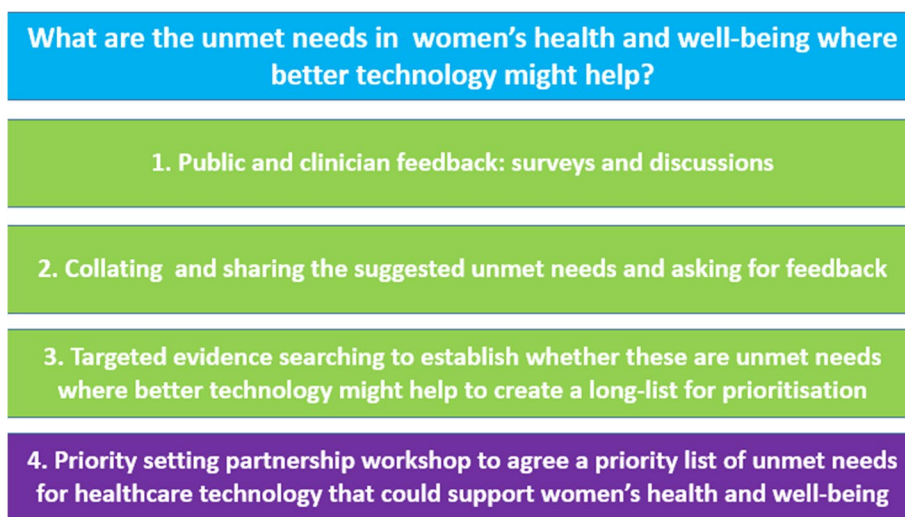
Fig. 1 Schematic representation of project process

We report both the methods and then our project findings aligned within the project sequence of steps undertaken.