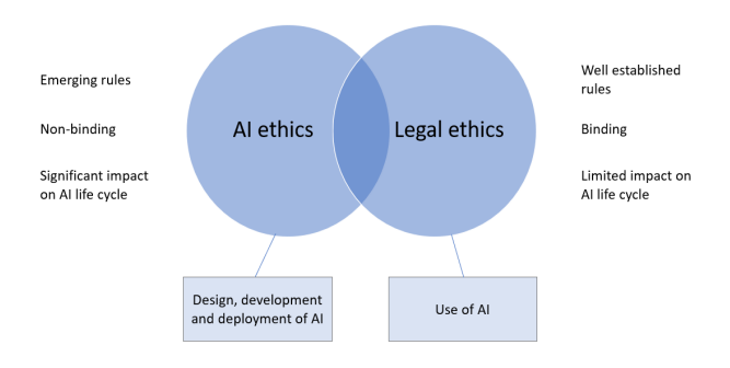
Figure 2: Interplay between 'AI ethics' and 'legal ethics'

While domain specific challenges, e.g. regarding data governance, choices of model and/or variables, are rather well-known, cross-domain challenges originate from the insufficient or lacking interfaces between these domains. Absent interfaces do often mean lack of inter-operation between these ethical domains although they might intersect as demonstrated in Figure 2.