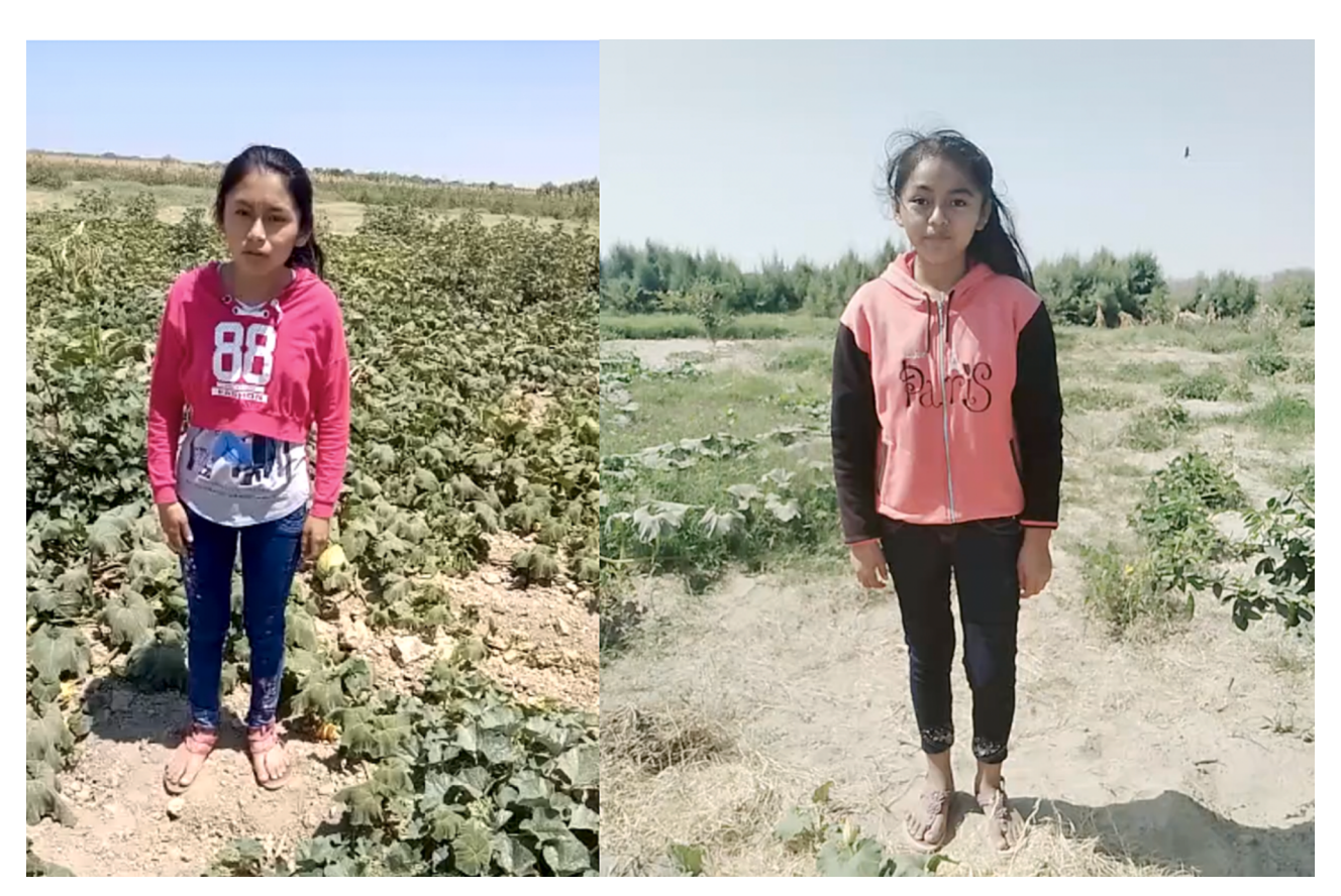
Fig. 3. Students in the videos they created, describing the agricultural landscape in the face of El Niño events. (Left: pumpkin, right: beans).