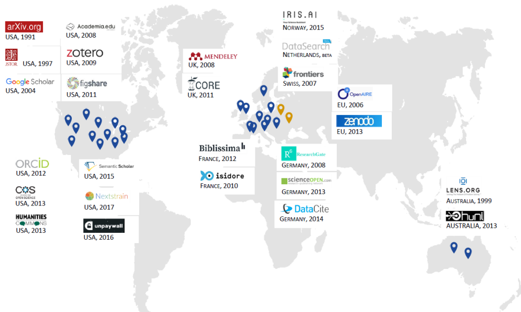
Fig 3: Overview of analysed platforms including location information and launch year

The analysis results can be summarized as follows: The main challengers have an established presence in the market, and the brands are well known. However, no successful platform targeting especially SSH community could be identified. Looking at the products and services provided by the competitors, we recognize that the planned feature-set for the TRIPLE platform (such as the conjunction of visualisation tool, annotation tool, trust building system, recommender system and crowdfunding service) represents unique features that will distinguish TRIPLE from the competition. Attention needs to be paid to a number of agile platforms which constantly release innovative (e.g. AI-powered) features. The interview results show that despite the many platforms and services available, there are still unoccupied market niches and underrepresented user groups that TRIPLE can target at.