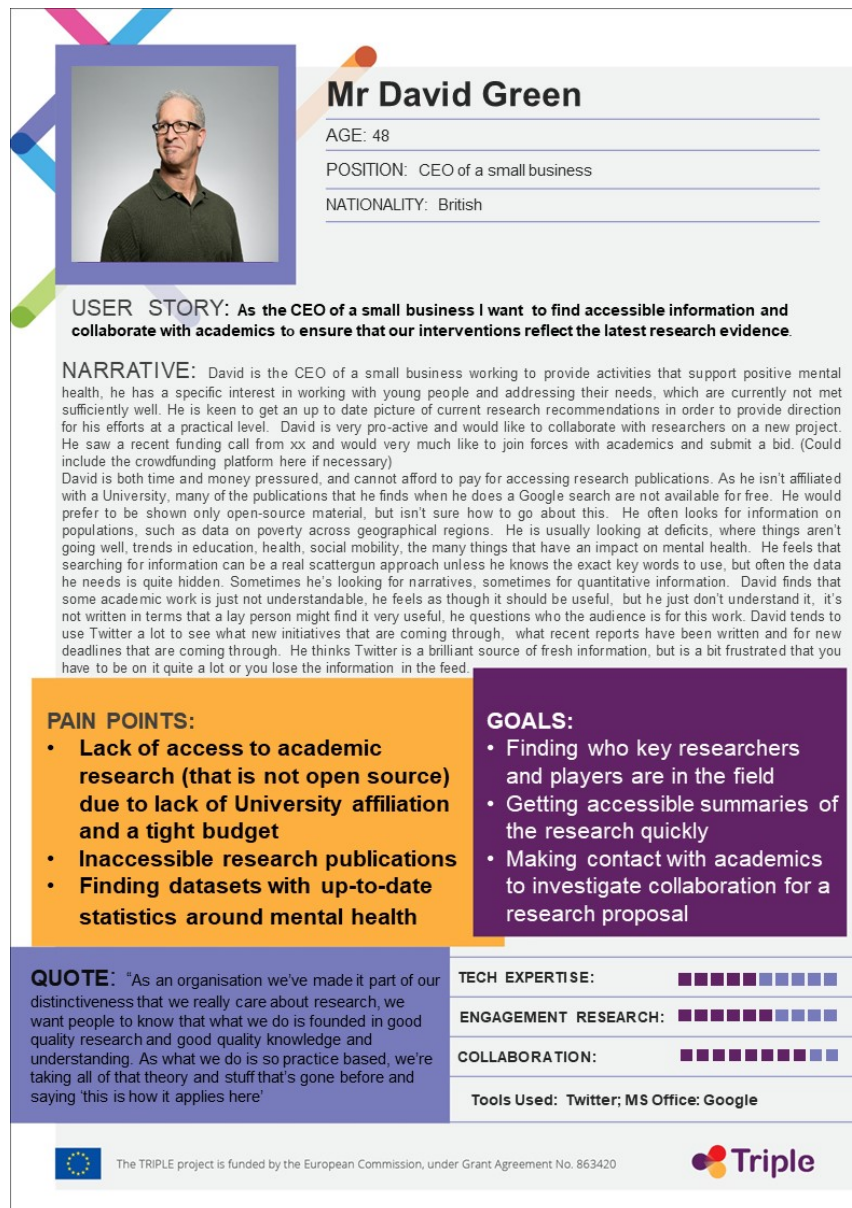
Fig. 1. Example of a non-academic persona created from the results of the requirement analysis

functionality of the platform, the process also increases ownership and engagement with the final product. An example of one of the non-academic Personas is shown in Figure 1. It highlights how the platform could facilitate interactions between academic research and industry and other SMEs.