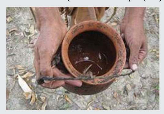
Fig 1: The risk of exposure to Nipah virus infection from collection pots of toddy due to excreta of bats

Thus, besides Malaysia, Nipah cases have been found in Singapore, Bangladesh, and India. These outbreaks have been scattered and small so far, with around only 600 cases recorded between 1998 and 2015, according to WHO. Thankfully, these Nipah virus outbreaks have been self-limiting because the virus doesn't spread very easily from human to human. Outbreaks have tended to fizzle out after four or five chains of transmission in humans. But our worry each time a new strain from bats infects people, it is a new opportunity for a more highly transmissible strain to take off and