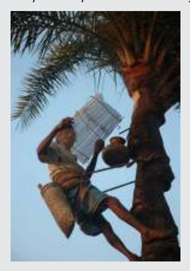
Fig 6: A date palm sap (Toddy) collector uses a bamboo skirt to cover an area of shaved bark on the tree and protect the sap from fruit bats; a method of making date palm sap safer to drink that is being tested in Bangladesh