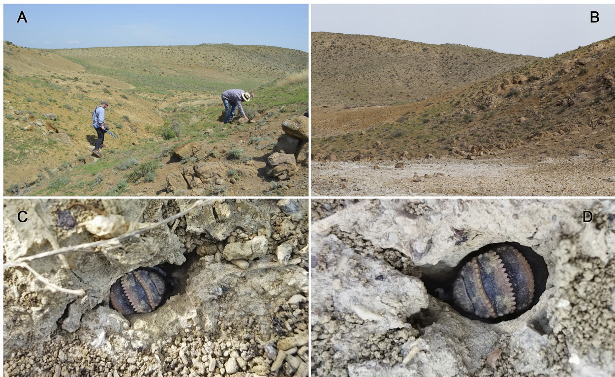
Figure 2. Natural habitat and burrows of H. klugii (Chachuna Managed Reserve). A: Qila Kupra, 18.04.2021; B: Qila Kupra, 18.04.2022; C and D: H. klugii in its burrow covering the entrance with body.