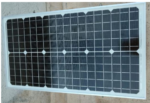
Figure 3: A thin, light and able to flex PV solar panel, with conversion surface of about 0.5 m 2 , 75 W nominal output power, 5V/12-18V output voltage, price €40.

The DIY PV system realized by authors consists of a solar PV panel, a charge regulator, and a conventional car battery (price €80). The photovoltaic panel is a device that allows the direct conversion of solar radiation into electricity, exploiting the photoelectric effect, and is the basic element of the PV system. Improving the efficiency of PV panels without increasing costs is a research field in physics, chemical and energy engineering. To date, the maximum efficiency of a commercial PV panel is around 20%. In the present case an online commercially available photovoltaic panel (Figure 3) has been adopted, which is thin, light and able to flex solar, with a photovoltaic conversion surface of about 0.5 m 2 , a nominal output power of 75 W, output voltage as 5V/12-18V, at a price of 40 €.