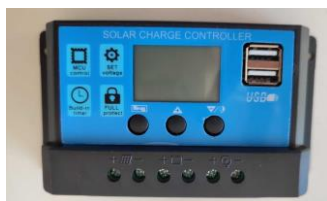
Figure 4: The charge controller adopted for DIY PV system, price €10.

polarity. In this way it is possible to prolong life of battery. A commercially online available charge controller was adopted (Figure 4).