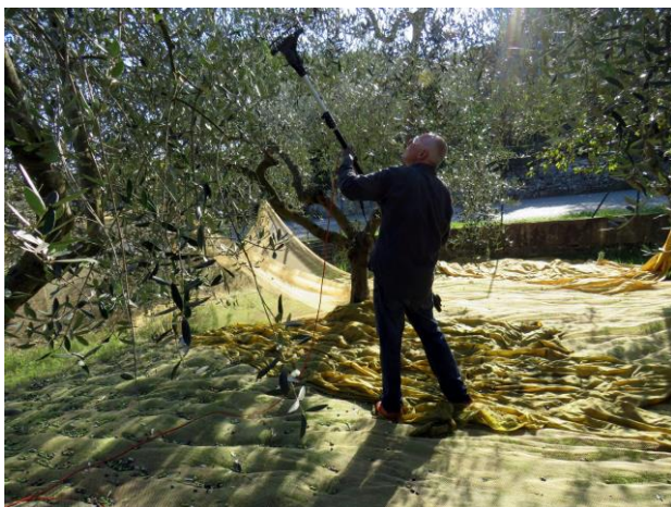
Figure 1: Olive harvesting with a hand-held, battery-equipped harvester.