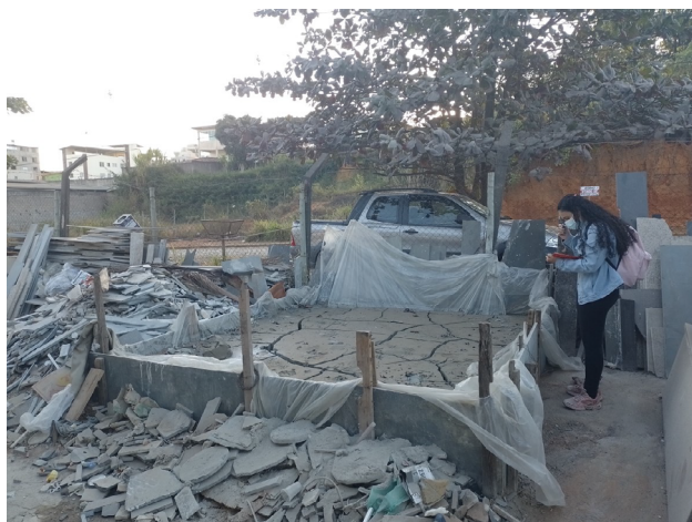
Figure 1. Waste reservoir of the marble shop where the sample studied was collected.

The samples consist of fine (2–0.075 mm) and ultrafine (< 0.075 mm) waste generated in the cutting and polishing phase of various ornamental rocks, including mainly marbles, granite, gneiss, and gabbro, collected in a marble shop located at João Monlevade, Minas Gerais state. The mud results from the cutting and polishing phase; it is decanted, and the solid material is deposited in a temporary reservoir (Figure 1). When this reservoir is full, the marble shop hires a company for a final disposal of the material. The reservoir has about 2.3 meters of length and width, and is 50 centimeters thick, resulting in a storage of 2.645 m 3 . Three samples were collected making a vertical hole along the 50 cm thick, using a round handle articulated digger.