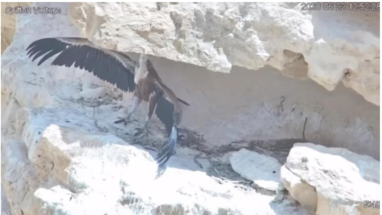
Fig. 2. After his mother died by electrocution, an endangered vulture chick is fed by "Mother drone," an advanced technology operated by the Israeli army.

This three-minute news item encapsulates the three-way dance between conservation, digital technology, and the Israeli army. The blurred classified drone, the obscured military general, and the three men—from high tech, conservation, and the military—congratulating themselves on their mothering skills, all occurred at one of the most visited national parks in Palestine-Israel, Ein Avdat in the southern Naqab-Negev desert, and was broadcasted live to the Israeli public via a 24/7 camera installation. This was not the first, nor would it be the last, collaboration between Israeli conservationists and the army.