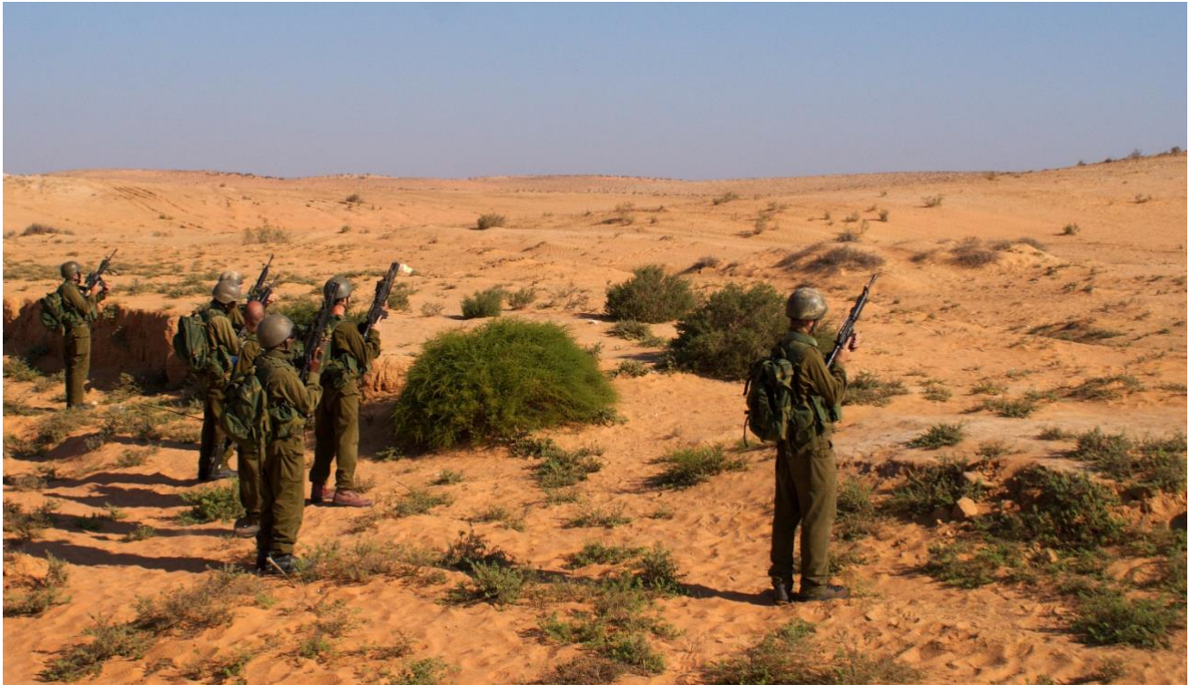
Fig. 1. Israeli soldiers exercise in a desert.

In July 2020, Israeli television reported on an endangered griffon vulture ( Gyps fulvus ) chick who had lost his mother to electricity wires. As would soon become clear, the chick's father was unable to provide enough food to ensure his son's survival. The Israeli army, referred to by most Israelis as the Israel Defense Forces (IDF for short, or Tsahal in Hebrew), readily stepped in, using a state-of-the-art drone technology to drop daily offerings of rat food for the chick by deftly managing the intense cliffs. "Mother drone," as the army referred to this technology, was blurred in the video that documented the operation. It had to be, the reporter explained, because it "belongs to the Israeli army and is classified as top secret." Standing with his back to the camera, the military general in command told the reporter about the countless hours spent practicing the delivery on a mock-up of the ledge and nest before the military started food drops for real. The report ended with the following statement: "The collaboration between a tech company, the military, and conservationists got the ultimate endorsement this week when the chick flew for the first time. Job [well] done!" (Figure 2). 1