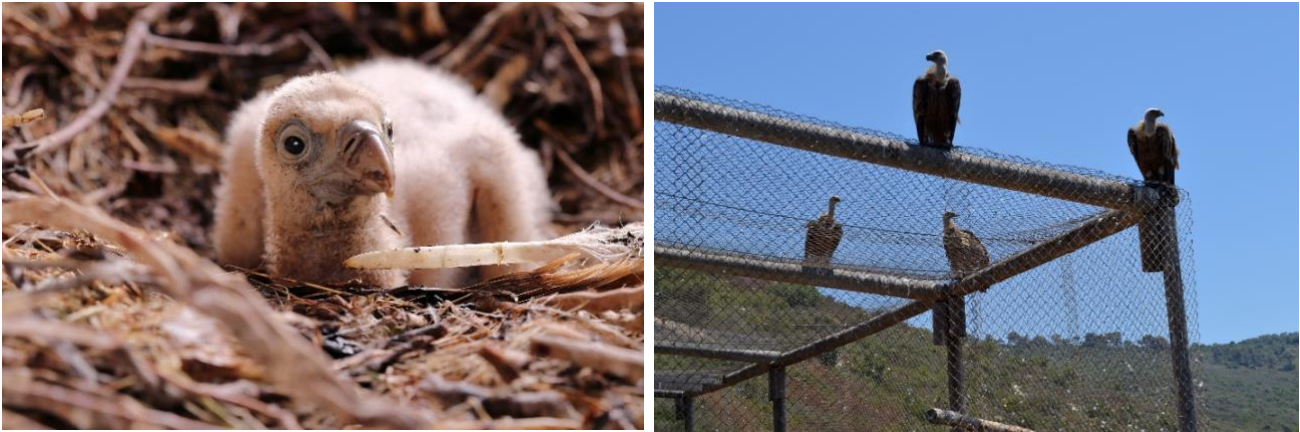
Fig. 3. (Left) A griffon vulture chick. (Right) Griffon vultures on top of their special training cage in the Carmel Mountains, Palestine-Israel.

There are currently 220 vultures in Palestine-Israel. They are intensively managed using various forms of digital conservation. The chief ornithologist for Israel's Nature and Parks Authority told me accordingly: "I cannot think of any other animal on this planet with such high monitoring rates. We have about 80 percent monitored by GPS and 75 percent of the vultures are tagged, meaning we know their history and we also [genetically] sample each one." 13 Through this digital monitoring, an enormous body of data is accumulated about the vulture's location, body temperature, and movement. Specifically, acceleration data that identifies movement is analyzed to extract nuanced information about vulture behavior. This type of study is situated within the field of movement ecology, which promotes an understanding of movement patterns and their role in various ecological and evolutionary processes. Such complex conservation projects necessitate engagement with computer science, paradoxically distancing biologists from the very sites and materialities of their research. The alienation that occurs with such conservation management by algorithm highlights that "digital data enables and encourages the automation of conservation decisions." 14