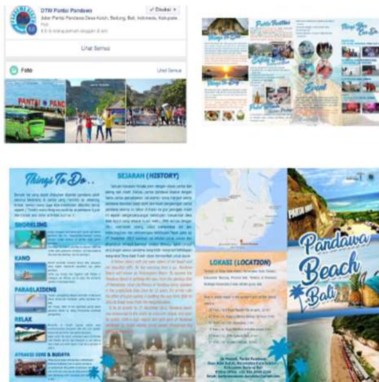
Figure 2. Pandawa Beach marketing strategy model

Act is when tourists find all the answers to their questions about existing Pandawa Beach, so they will take action visits. At this stage, it is best if the Pandawa Beach ensures all the information that tourists get is in accordance with what was received at the time of visiting, so as to minimize disappointment from them. Advocate is the last stage that is expected after making a visit, it is hoped that it will recommend the community to visit the Pandawa Beach. One of them can be done by creating promotional programs through existing social media. Visitors who have come can follow the Pandawa Beach social media accounts and share their visits on social media.