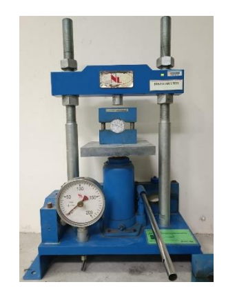
Fig. 4 Brazilian test equipment