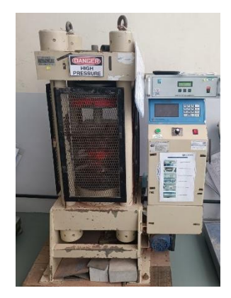
Fig. 3 Compression machine