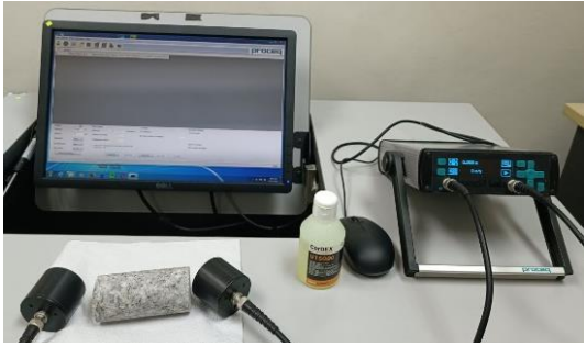
Fig. 2 The arrangement of PUNDIT test

The PUNDIT test, commonly employed for rock and concrete, is an indirect and cost-effective method [1]. The pulse velocity in a material relies on its density and elastic properties, which, in turn, are associated with the material's quality and strength. In this study, the PUNDIT test serves as a reliable and accurate approach to determine the P-wave velocity in the rock samples [4]. Fig. 2 illustrates the equipment and arrangements employed in the PUNDIT test.