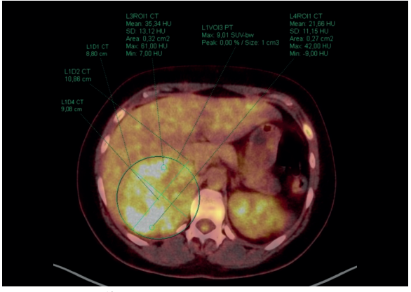
Figure 2. Fluorine-<sup>18</sup>F-FDG-PET-CT PET-CT scan indicating high FDG uptake (SUV max 9.0), more than 3 times higher than the adjacent liver

A 33-year-old woman with hypertension and oligomenorrhea for last 6 months, with an incidentally diagnosed abdominal mass on ultrasound underwent an MRI and <sup>18</sup>F-FDG PET-CT (fig. 1, 2). No abnormalities were seen on lab tests. Initial diagnoses were ganglioneuroma, adrenal cortical carcinoma (ACC) and pheochromocytoma. Ganglioneuroma was supported by age, normal/ lower level of adrenal hormones, well-circumscribed margins, progressive enhancement and persistent in delayed phase (in T<sub>1</sub>w before and after dynamic administration of gadobutrol) and no evidence of metastasis [1, 2]. ACC was supported by haemorrhage on T_1 w, heterogeneous T_2 w signal – higher than an adjacent liver, enhanced density of periadrenal fat [1, 2]. Pheochromocytoma was less confident due to the relatively low signal on T<sub>2</sub>w. High FDG uptake (SUVmax 9.0) suggested a malignant character. For all diagnosis parameters like lesion size (11 cm), there was no presence of drop of signal during out-of-phase sequence, no evidence of IVC invasion and local compressive symptoms showed