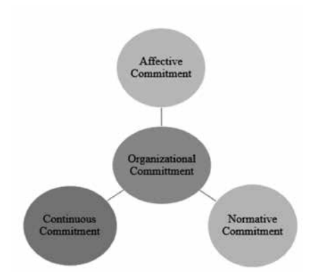
Figure 1. The dimensions of organizational commitment

ucation, teachers' organizational commitment refers to their identification, orientation, and involvement in an academic setting (Ni, 2017). The term relates to teachers' positive attitudes towards an academic organization, which connects their identity to that place (Derakhshan et al., 2023b; Fathi & Savadi Rostami, 2018). Organizational commitment is a complex and multi-faceted construct (Figure 1) made up of three dimensions, namely affective commitment, normative commitment, and continuous commitment (McShane & Von Glinow, 2010). The first component concerns teachers' psycho-emotional bond with an educational organization. The second dimension refers to teachers' passion for working for an organization due to moral and ethical concerns. The third dimension pertains to teachers' willingness to stay in an organization given their close connection with others (e.g., learners, colleagues) and the subject matter (Rusu, 2013).