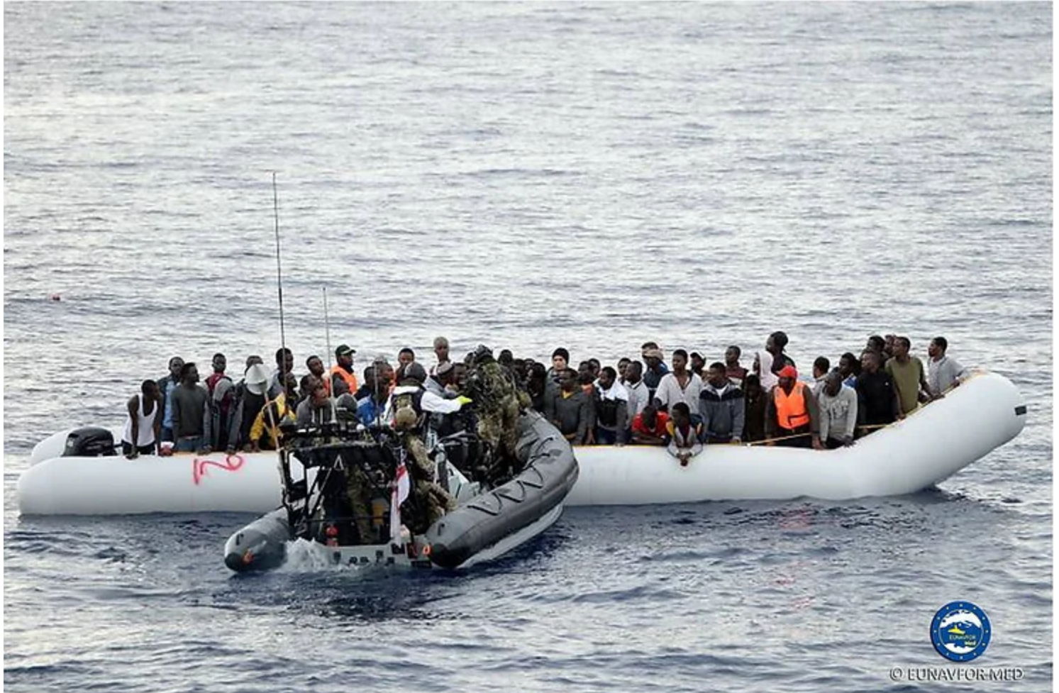
Image "HMS Richmond Sea Boats Rescue Migrants" by csdp.eeas is marked with Public Domain Mark 1.0.

As if haunted by the past, the headlines are once again filled with cautionary tales of Europe's unsecure borders and looming migration crisis. The arrival of 11,000 migrants on the Italian island of Lampedusa in early September,[1] amidst deadlocked negotiations over the European Union's New Pact on Migration and Asylum,[2] has again sparked debate in Europe about how to tackle illegal immigration from North Africa.[3] The proposed solution that has perhaps drawn the most attention is that of a naval blockade.