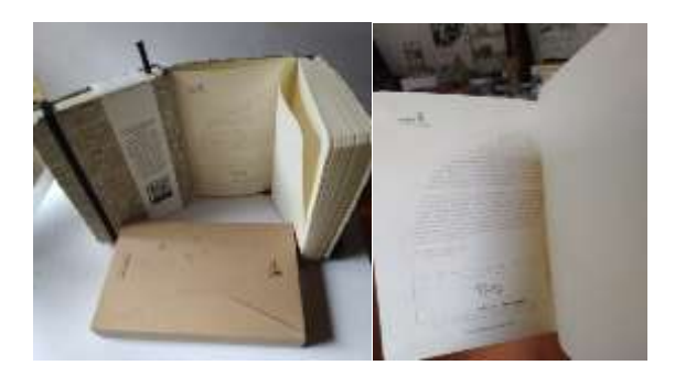
Figure 7. Background story of XYZ and weavers in notebooks and QR code products

addition, in some products, there is a background story for the establishment of XYZ, with a QR code formed to make it easier for people to read the story through online media.