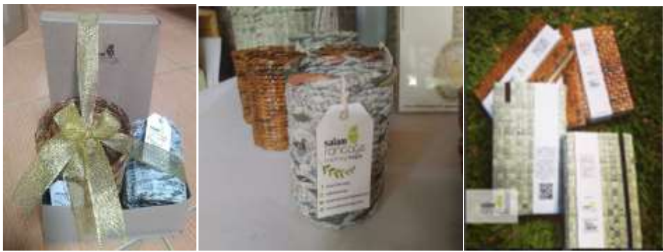
Figure 6. Packaging, labeling, and co-branding of XYZ products

XYZ social entrepreneurship produces unique premium handicrafts. The uniqueness of the product lies in the basic material of the craft, namely, old newspapers. In the production process, XYZ pays close attention to customers' wishes, thus opening opportunities for customers with certain needs to customize their products. One form of customization is product packaging, which involves placing the name and logo of the company/organisation in each product ordered. Newspaper crafts are usually packaged with environmentally friendly packaging and include name, logo, and company contact, making it easy to contact potential customers. XYZ also expresses its social mission by adding the slogan 'crafting hope' to every product packaging. The packaging, labeling, and co-branding of XYZ products are shown in Figure 6.