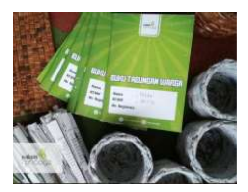
Figure 2. Citizen savings book

XYZ designs empowerment activities according to the community needs. Artisans are trained in weaving and encouraged to become individuals who can benefit their families and communities. Weavers are also trained in leadership, organization, and financial planning to increase their capacity. In addition, the Bank Sampah program is still being conducted to teach artisans and the general public about responsible waste management. XYZ also created a savings book for each individual (see Figure 2). The results of waste deposits to the Garbage Bank and woven newspaper crafts were recorded in the residents' savings book. The function of this savings book is to manage residents' income by depositing garbage and woven newspaper craft.