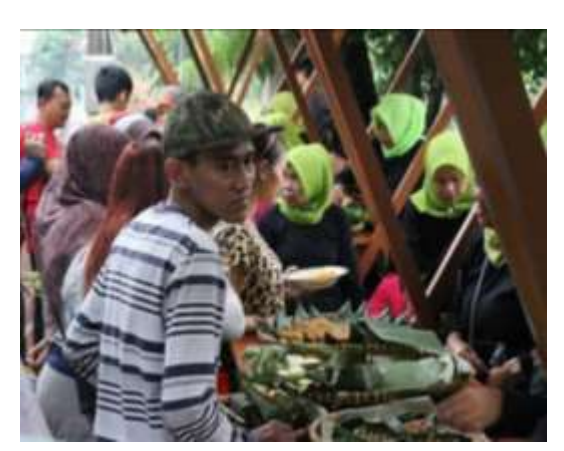
Figure 4. Dongko market program

The Sekebun project between XYZ and the HA IPB also introduced a new programme. The program is called Pasar Dongko (Dagangan Orang Gang Kodir) and is held at the same location as the Sekebun Project (Figure 4). With a touch of locality, in Pasar Dongko, residents sell their plantation and processed products. Moreover, the community shows zero-waste commitment by not providing plastic to buyers (zero plastic waste). The programme was implemented once a month at the end of the month.