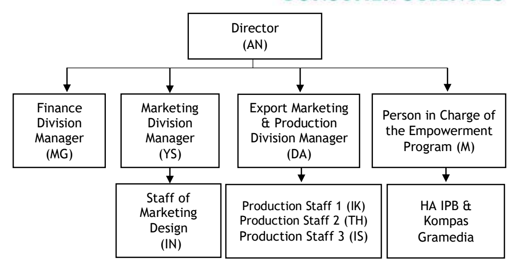
Figure 5. Organizational structure of XYZ