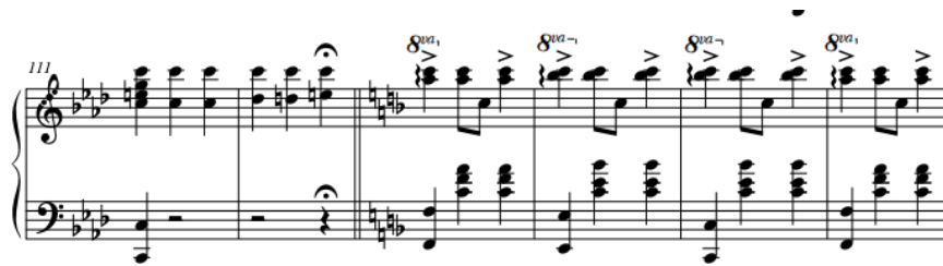
Fig. 7: Example 7. Carlos Gomes , mm. 111–116.

but some might be applied at the end of phrases and sections. Voicing is needed for the top notes of chords and double notes in the RH and also for the melodic line in moments where the RH plays “melody + accompaniment.” It is also necessary to be attentive to the balance between the hands since in many instances, the bass is doubled at the octave and should not be overemphasized (see Example 7). Articulation marks include accents and slurs. Where there is no indication, the student will need to analyze each passage and experiment under the teacher’s guidance.