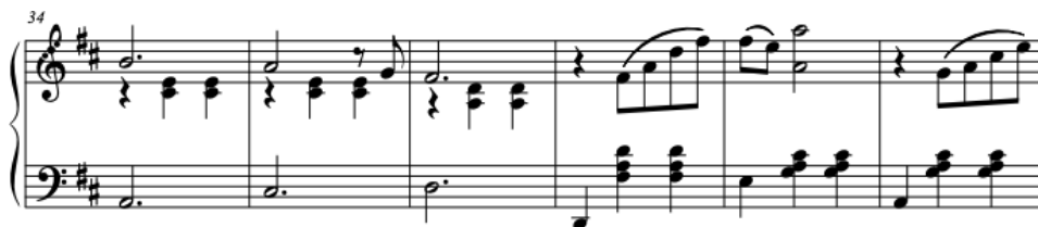
Fig. 3: Example 3. Maria , mm. 34–39. Mm. 34–36 may feature a syncopated pedal, whereas mm. 37–39 may have the pedal lifted in the second beat.

The use of the pedal will be different according to the needs of each passage and varying the way it is applied helps change the color of each section. For example, mm. 2–5 (as well as 10–15) may have the pedal pressed in the first beat and released in the third beat. In mm. 6–8 and also in the “B” section, it may be lifted in the second beat. The “C” section might feature a syncopated pedal in mm. 34–36 and 42–44 (see Example 3), and it can be lifted in the second beat in other measures.