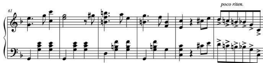
Fig. 4: Example 4. Ortruda , mm. 61–66.