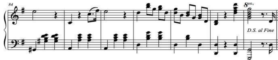
Fig. 5: Example 5. Cecy , mm. 84–90.

disrupting the rhythmic flow. Some of the technical difficulties encountered are: repeated five-note chords in the LH, repeated notes in the LH played over a held bass, big leaps not only in the LH, but also in the RH (mm. 41–42, 61–69, for example), parallel blocked octaves (especially in the RH), finger substitution (mm. 45 and 53), variety in the accompaniment, arpeggiated patterns in the RH, and a scale fragment that uses chromaticism (mm. 21–22). Attention is also needed to the right-hand passage in mm. 87–88 (see Example 5), and it can be practiced as blocked chords before attempting to play it as written.