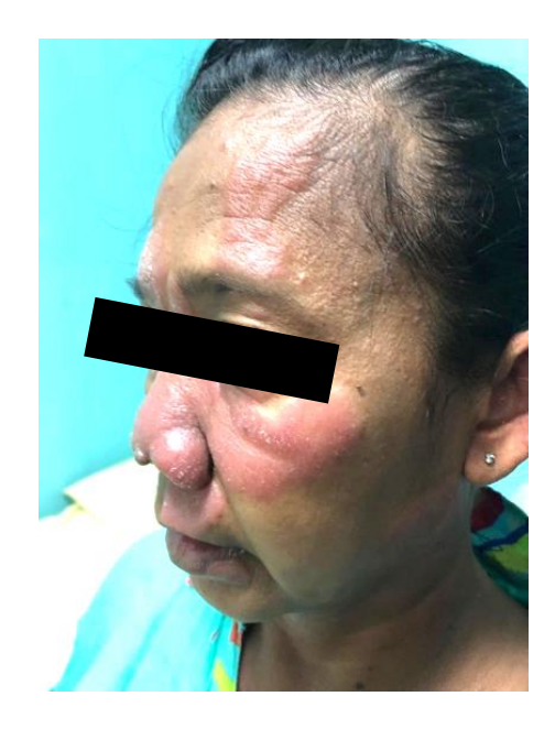
Figure 2. Borderline leprosy: Elevated facial lesion.<sup>13</sup>

The tuberculoid borderline lesion is similar to that of tuberculoid lesion, only with smaller size and larger quantity. Paucibacillary lesion tends to scatter and might be grouped. The skin tends not to produce sweat, causing the affected surface to appear dry and coarse. Macules and plaques might appear ring-like, indicating the occurrence of central healing. Papules might appear grouped, forming a plaque or a border of macule or annular lesions. Around the larger lesions (BT), where the edges are less demarcated, smaller satellite lesions might appear. Enlarged or protruding nerves might be palpated near larger infiltrated lesion.<sup>15</sup>