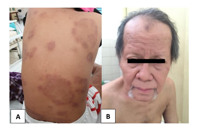
Figure 3. Borderline lepromatous leprosy: Multiple scattered plaques (A). Lepromatous leprosy: madarosis (B). <sup>2,13</sup>

classification. A biopsy is useful to confirm diagnosis, prognosis, and evaluate the therapy. A peripheral nerve biopsy is a useful tool in diagnosing leprosy whenever physical examination and a skin biopsy is inconclusive. The histopathological characteristic of tuberculoid leprosy is the presence of epithelial cell granulomas. This is under the presumption that the M. leprae lies on the Schwann cells of the nerve, particularly on colder areas, places of trauma, or superficial parts of trapped nerves. Nerve lesion on lepromatous leprosy (LL) is characterized by bacterial multiplication without inhibition, mainly on Schwann cells, due to the lack of efficient cellular immunity against M. leprae . In BB-LL leprosy, there is focal and diffuse nerve involvement.<sup>13,21,22</sup>