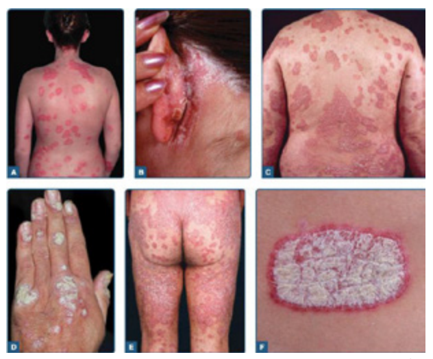
Figure 2. The clinical picture of plaque psoriasis.<sup>4</sup>

(CASPAR), The Disease Activity Index for Psoriatic Arthritis (DAPSA), and Psoriatic Arthritis Disease Activity Score (PASDAS).<sup>10</sup>