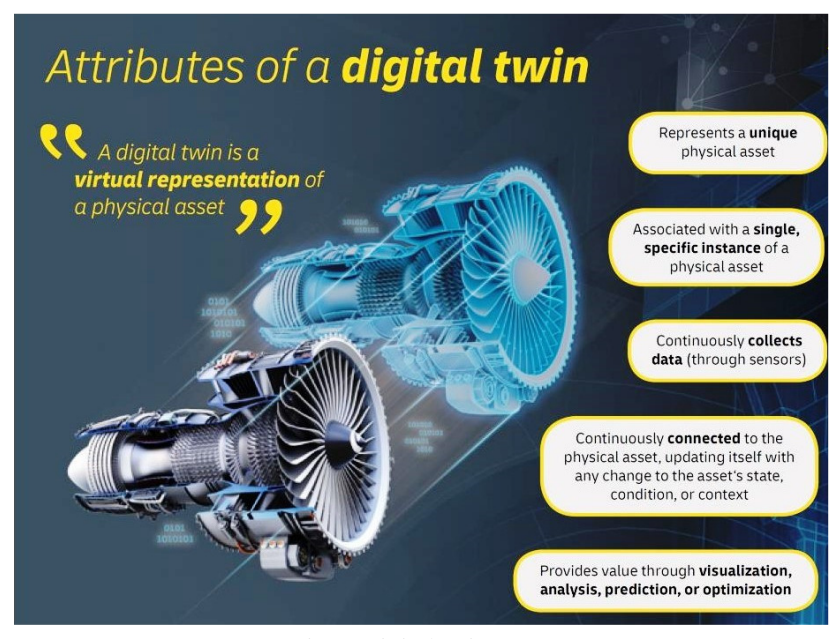
Fig. 3 Digital twins [27]

Fig. 3 illustrates the properties of a digital twin as a software representation of a physical asset. It enables us to model all possible states of the robot in the framework of prediction and analyze the behavior of the robot based on sensed variables in real operation.