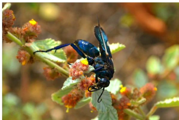
Figure 2. Pepsis decorata collected in the Mata Seca State Park, Minas Gerais, Brazil.

The Entypus Dahlbom, 1843 genus has the second highest diversity of Pepsinae species in the Neotropical region, presenting 38 species (FERNÁNDEZ et al., 2022). Entypus taschenbergii (Dalla Torre, 1897) can be found in Mexico, in the Dominican Republic, and throughout South America (ROIG-ALSINA, 1981).