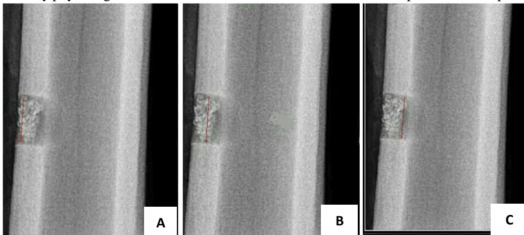
Figure (3): Red line represent Focal of Interest (FOI) for densitometric analysis of bony defect at the upper (A), middle (B) and lower regions (C).