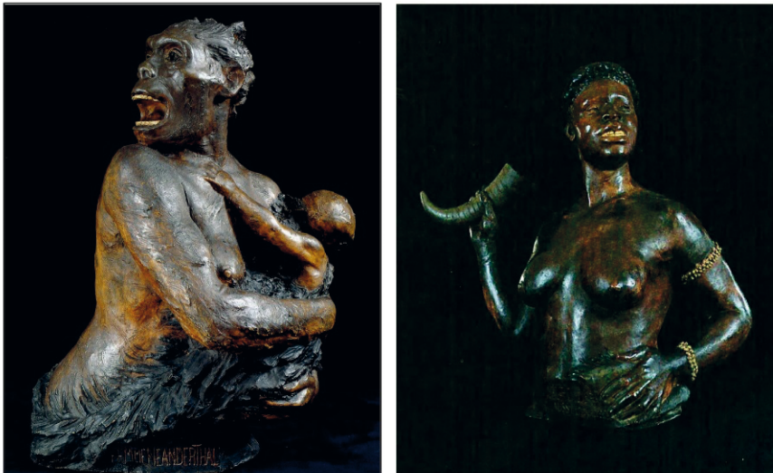
Figure 3. The two visions of prehistoric women. From left to right: Femme de la race de Néandertal and Femme négroïde de Laussel , both in plaster painted by Louis Mascré around 1910.