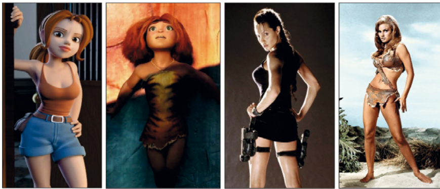
Figure 5. Female archetypes in cinema: archaeologist vs cavewomen. From left to right: Sara Lavrof ( Tad, the Lost Explorer , Enrique Gato, 2012), Eep ( The Croods , Chris Sanders and Kirk DeMicco, 2013), Lara Croft ( Lara Croft: Tomb Raider , Simon West, 2001), Rachel Welch ( One Million Years B.C. , Don Chaffey, 1966).