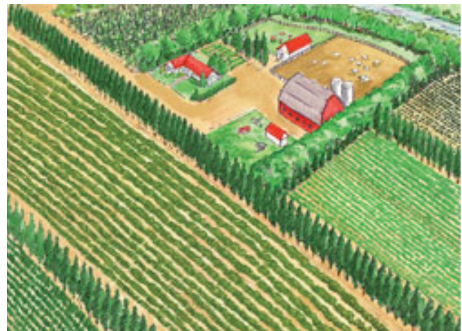
Figure 4. Windbreaks protecting the home, livestock, and crops.

The area protected by and the effectiveness of a windbreak are determined by height, density, width, orientation, length, and species composition. Wind speeds are reduced on the windward side of a windbreak to a distance of 2 to 5 times the height of the tallest row. On the leeward side, wind speeds are reduced for a distance of 10 to 20 times the height ( H ) of the trees. Windbreak density (the ratio of the solid portion to the total area; table 1) determines the amount of wind that flows through the windbreak. Densities of 40% to 60% provide the greatest leeward area of protection. Livestock windbreaks and crop windbreaks require different densities as well as orientation for optimal protection during sensitive seasons. Windbreaks are oriented perpendicular to hot, dry summer winds to protect field crops during the growing season, perpendicular