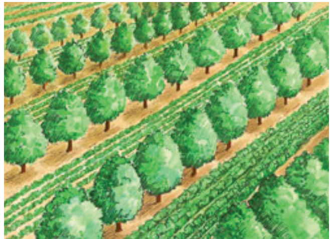
Figure 2. Alley cropping.