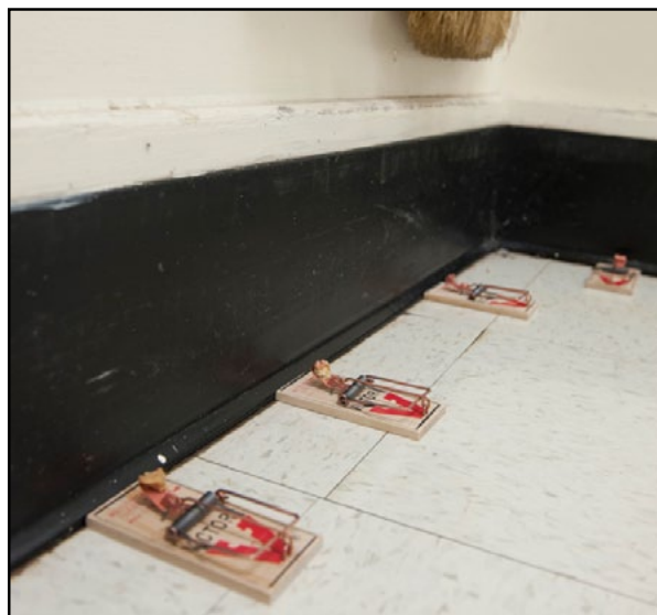
Figure 7. Traps can be baited with a variety of foods. There is no one favorite bait for mice.

Plastic snap traps (e.g., the Kness Snap-E, J.T. Eaton JAWZ, Bell Trapper Mini Rex, Woodstream Quick Kill, etc.) are more durable and can be cleaned with disinfectants more easily. The disposable