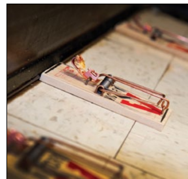
Figure 8. The proper way to position a snap trap against the wall.

Despite common myths, there is no one “favorite” bait for mice. Mice are opportunists and will sample most foods they bump into. Mice forage for nesting materials as well as food, so cotton balls may be used as bait. Mice mainly travel along walls, so place traps up against walls with the snap end facing the wall (Figure 8).