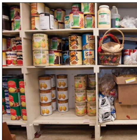
Figure 5. Once inside a school, mice will nest in such mouse-vulnerable areas as a food pantry or stuffed furniture in a staff lounge.