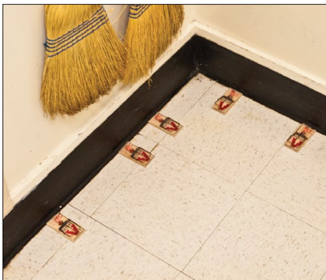
Figure 6. Set out several traps about 3 feet apart and sometimes closer, then remove them and set them up a week later in a new location.