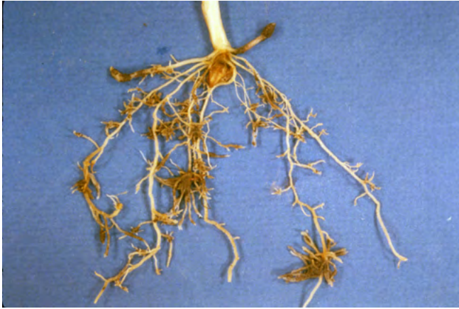
Figure 1. Roots invaded by cereal cyst nematode.