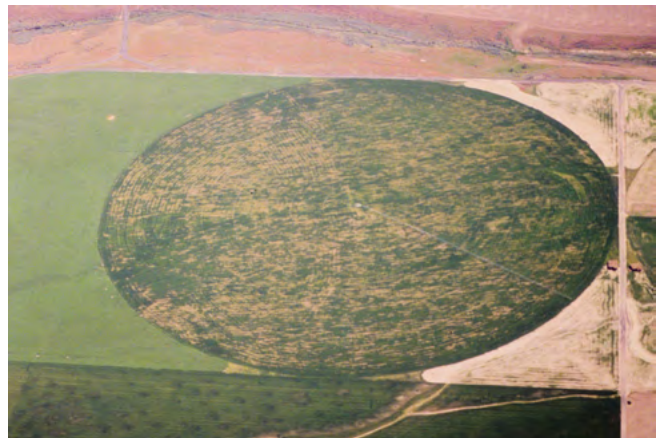
Figure 16. Irrigated wheat with extensive stand failure caused by take-all.