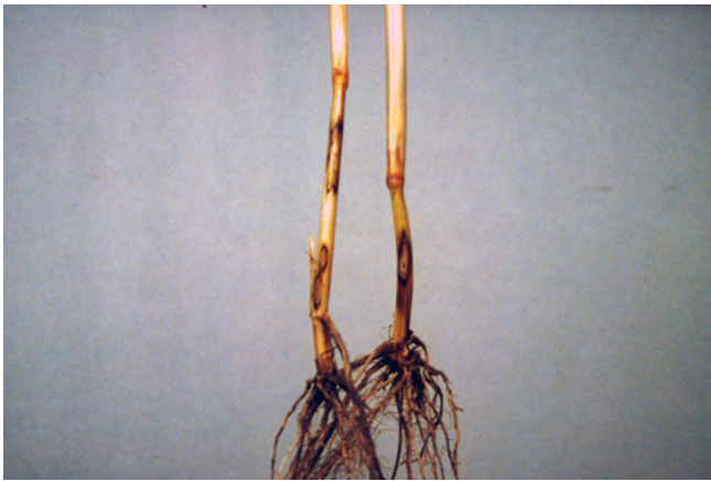
Figure 13. Weakened lower stems caused by strawbreaker foot rot (eyespot).