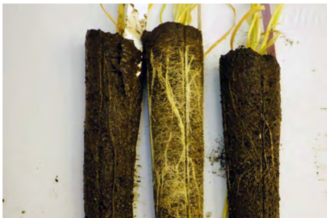
Figure 9. Roots deteriorated by root-lesion nematode (left and right) compared to roots of a resistant wheat landrace breeding line (center).