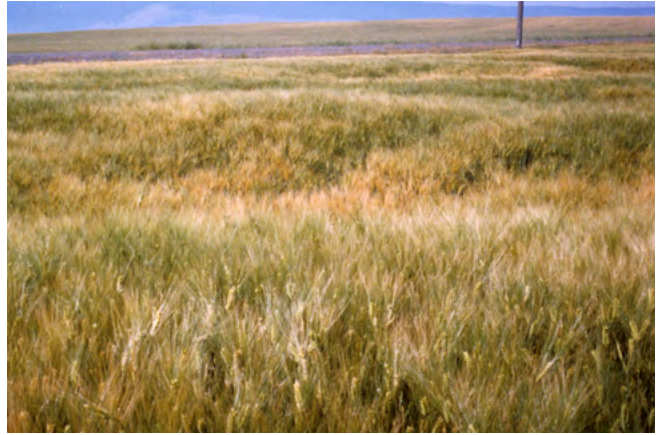
Figure 2. Wheat affected by cereal cyst nematode.