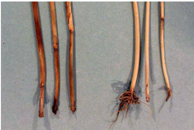
Figure 5. Honey-brown discoloration of lower nodes (left) caused by Fusarium crown rot.