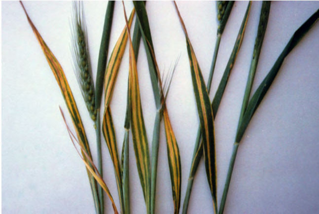
Figure 3. Leaf banding caused by Cephalosporium stripe.