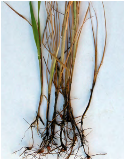
Figure 15. Blackened roots and lower stems and seedling death caused by take-all.