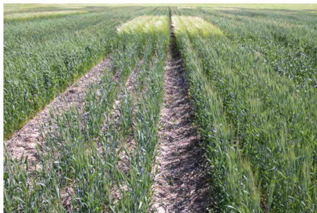
Figure 10. Root-lesion nematode reduced the plant vigor of wheat unprotected by an experimental nematicide. Note the equal growth of barley in unprotected (left) and protected (right) drill rows.