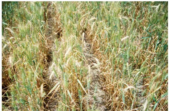
Figure 6. Whiteheads caused by Fusarium crown rot.