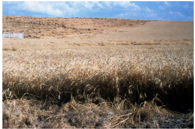
Figure 14. Wheat lodging caused by strawbreaker foot rot (eyespot).