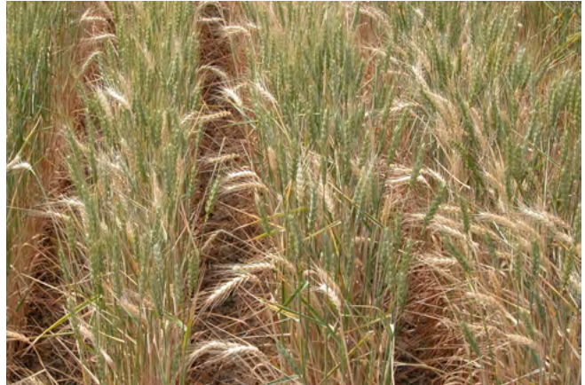
Figure 4. Whiteheads caused by Cephalosporium stripe.