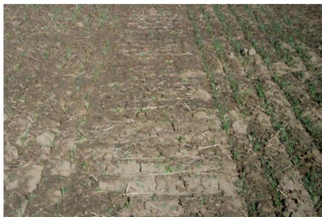
Figure 8. Pythium damping-off greatly reduced the stand of wheat unprotected by seed treatment (left) compared to the stand grown from seed treated with fungicide (right).