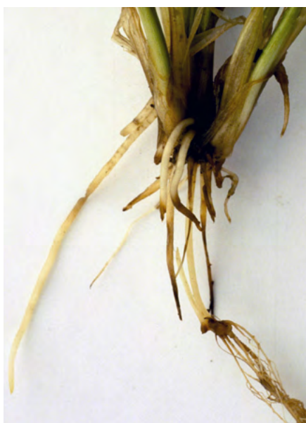
Figure 11. Crown roots severed by Rhizoctonia root rot (bare patch).