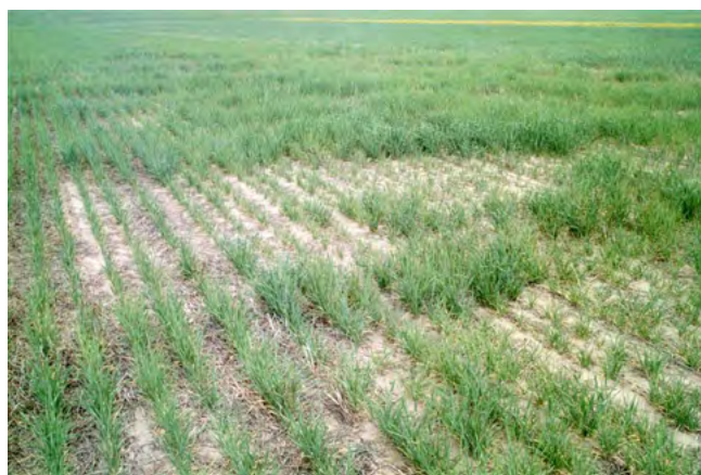
Figure 12. Rhizoctonia root rot (bare patch) of wheat.