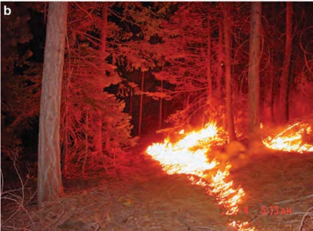
Figure 1. Examples of fire and fire-surrogate treatments applied in order to reduce fire hazards in mixed-conifer forests in the central Sierra Nevada, California. (a) Mechanical fuel treatment using a rotary masticator mounted on an excavator. (b) Prescribed fire at night.

stand-structure goals similar to those obtained by prescribed fire. Until recently, however, we knew little about the possible unintended consequences that might arise from widespread application of fire-surrogate treatments in seasonally dry forests.