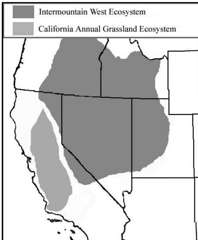
Figure 1. Map of the Intermountain West and California Annual Grassland regions in the western United States.

Because medusahead occurs across such a broad array of ecosystems, development of uniform guidelines to prevent invasion from occurring and manage and restore rangelands where it already exists have been difficult (Davies and Johnson 2011; Young 1992). There are many management options for the control of medusahead but there are no thorough summaries of the current management options across the range of the problem.