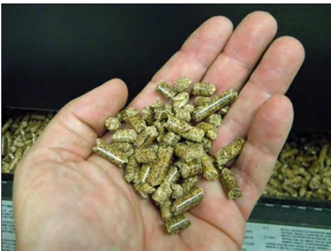
Figure 3. Wood pellets.

Wood pellets (Figure 3) are usually sold in 40-pound bags. Prices are often expressed in dollars per ton (fifty 40-pound bags). Pellet fuels typically have a moisture content of around 5 to 10 percent. Good-quality wood pellets at 5 to 10 percent moisture content have a heating value of approximately 16,500,000 BTU per ton or about 8,250 BTU per pound.