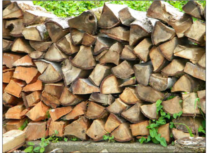
Figure 2. Stacked firewood should have good air flow so that it dries properly.