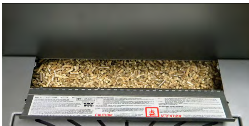
Figure 5. Wood pellets in a pellet stove hopper.