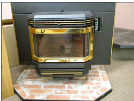
Figure 4. Pellet stoves are more efficient than an open fireplace.