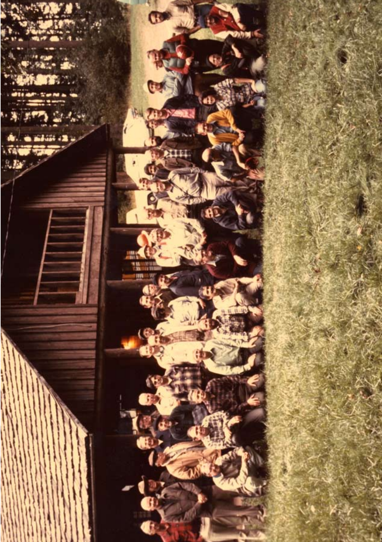
Forestry faculty in front of the Forestry Club Cabin.