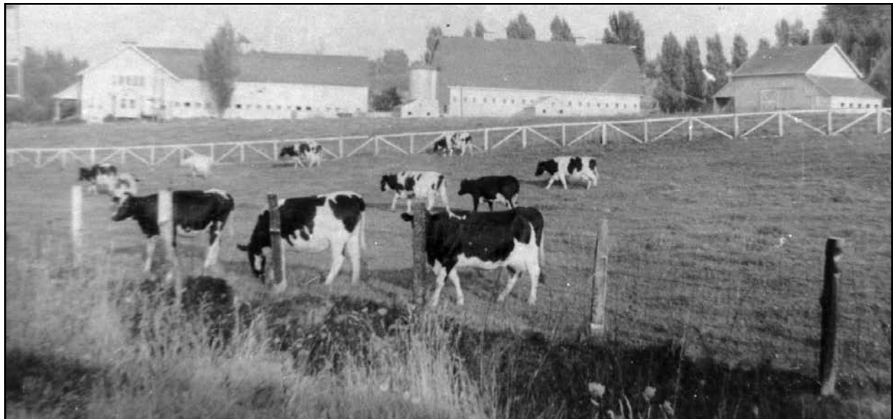
Dairy cows and cow barns at the Multnomah County Poor Farm in the early 1940s.

Yes. Tualatin Grade School and Sherwood High School. When I graduated from high school in 1942, the very first job I had was working on the Multnomah County Poor Farm, milking cows.