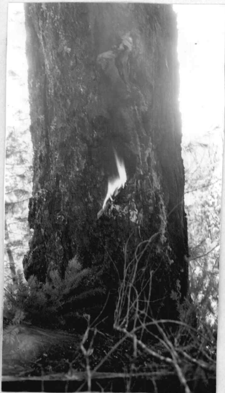
Hole in Bark Method of Burning