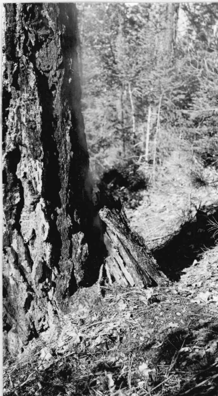
Base Fire Method of Burning