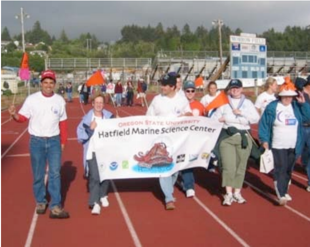
In August 2004, a team of walkers and runners representing HMSC raised $1,287 for the American Cancer Society during the 24-hour Lincoln County Relay for Life event held at Newport High School.

coordination with the Salvation Army and My Sister's Place. Weeks later, an emergency aid appeal coordinated by an HMSC graduate student raised thousands of dollars for tsunami relief assistance in a remote area of Sri Lanka that had not yet received substantial international disaster aid. HMSC staff and students also participated in blood drives for the American Red Cross and sponsored a weekly soup kitchen during the month of March to raise money for the Lincoln County Food Share.