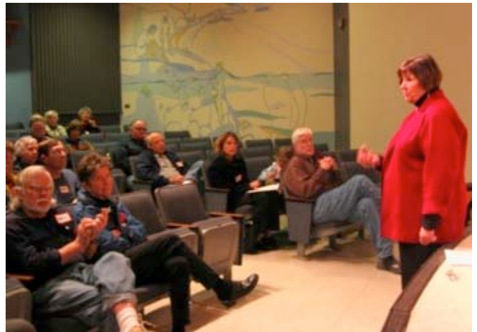
HMSC is a popular venue for public forums and town hall meetings, like this one hosted by U.S. Representative Darlene Hooley in January 2005.