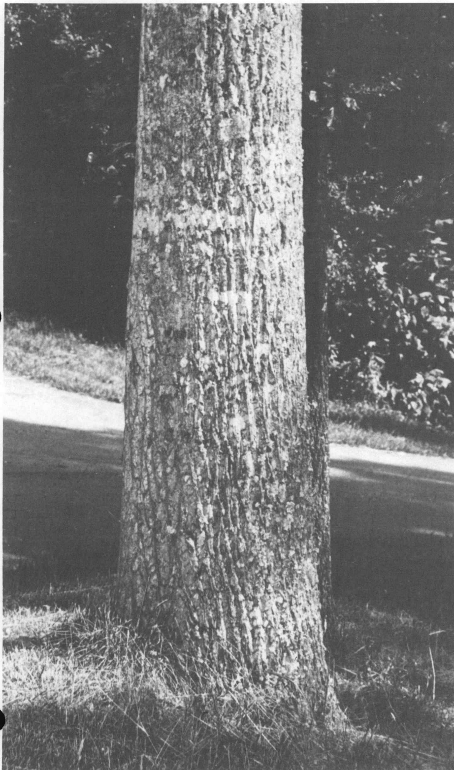
Figure 4—Bark of mature yellow-poplar.

but the damage is not serious. Sapwood and heartwood borers occasionally cause minor damage.