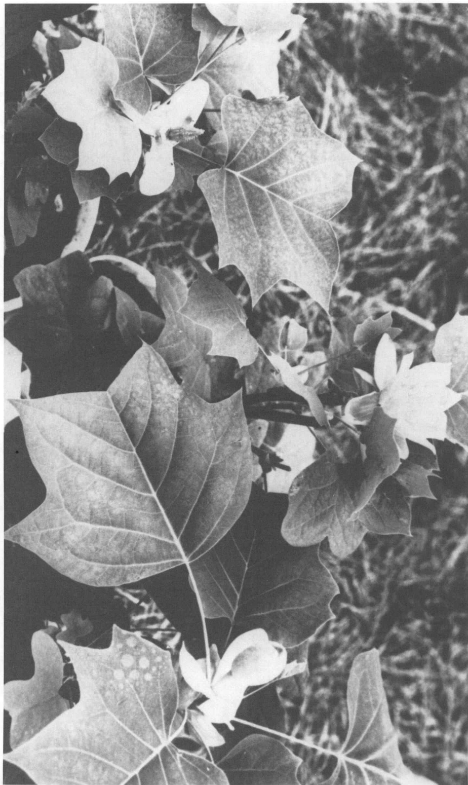
Figure 2—Mature leaf, twig, fruit, and flower of yellow-poplar.

Yellow-poplar is a prolific seeder—300,000 seeds per acre is not uncommon. Because of inefficient pollination, only about 10 percent of the seeds are viable in most trees; however, some trees produce 35 percent sound seeds. The normal seed-bearing age is 15 to 20 years, but trees as young as 9 or as old as 200 years can bear seeds. Successful establishment of yellow-poplar seedlings requires that an adequate number of viable seeds fall on mineral soil that is moist and well drained. Direct sunlight is essential for early growth, but some sheltering of seedlings by a light cover of grasses or bushes is needed. Once seedlings are established they must maintain a dominant position relative to other vegetation if they are to survive. This usually means heavy cutting of timber—either clearcutting, seed-tree cutting, or selection cutting—to provide