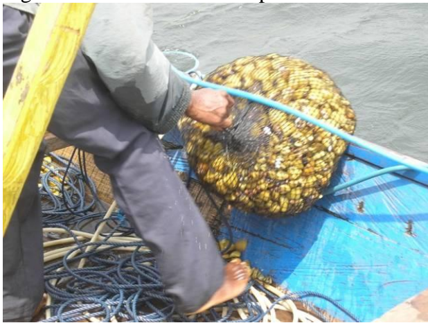
Fig 4C. Hauling the net aboard after fishing