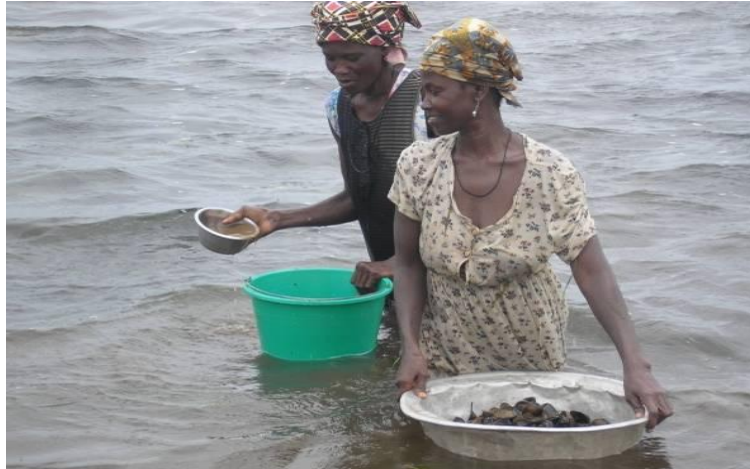
Figure 2. Women harvesting clams in the shallow areas of the Volta Estuary.

Hookah fishing is practiced solely by men who dive at the deeper zones of the river to collect the clams. The method involves the supply of air by compressors through a long hose to the fishers while submerged (Figure 3), allowing the fisher to remain underwater for 30 - 60 minutes. A diving mask is worn and the fingers protected with cellotape as the fingers are used to rummage the sandy sediments for clams that burrow below the surface with only their siphons protruding through the sand into the water. The fisher dives to the river bed with a net into which the harvested clams are placed.