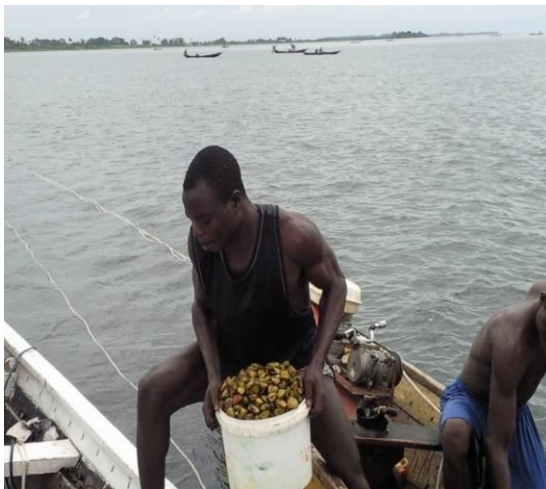
Fig 4E. Sorting the daily harvest into size classes