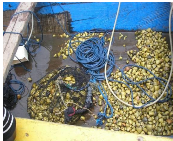
Fig 4D. Unsorted clam in a canoe