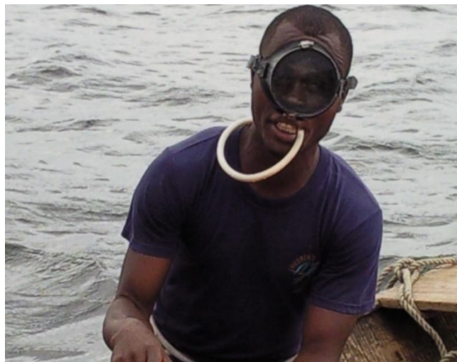
Figure 3. A Hookah fisher preparing for a dive

Hookah fishing is practiced solely by men who dive at the deeper zones of the river to collect the clams. The method involves the supply of air by compressors through a long hose to the fishers while submerged (Figure 3), allowing the fisher to remain underwater for 30 - 60 minutes. A diving mask is worn and the fingers protected with cellotape as the fingers are used to rummage the sandy sediments for clams that burrow below the surface with only their siphons protruding through the sand into the water. The fisher dives to the river bed with a net into which the harvested clams are placed.