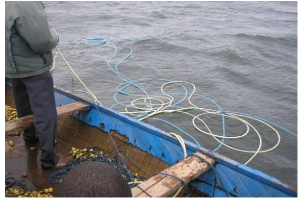
Fig 4B. The air supply hose