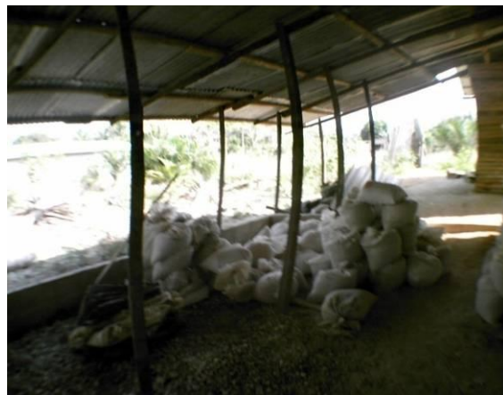
Fig 6F. Bagged milled shells ready for sale