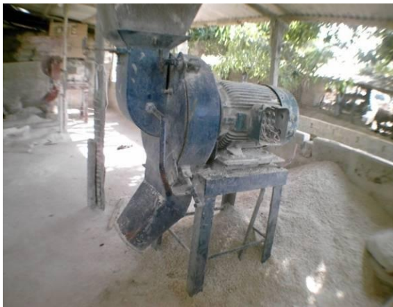
Fig 6E. A Shell Mill