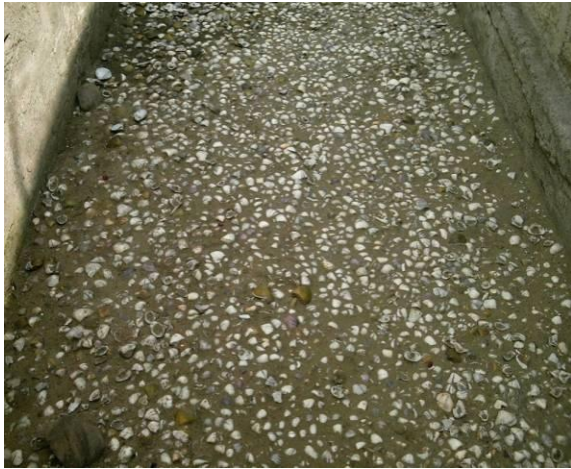
Fig 6A. Clam shell-paved lane in a village at Big Ada