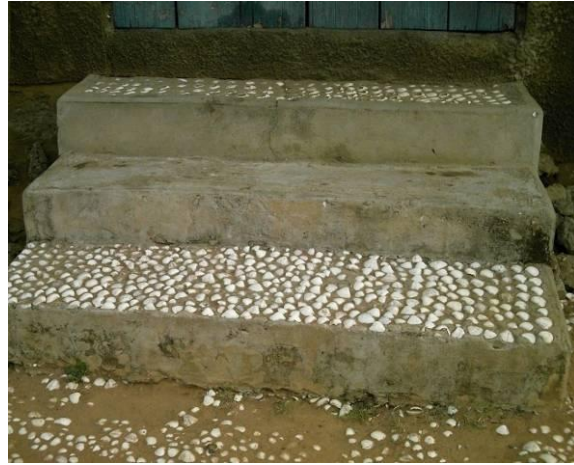
Fig 6B. Staircase decorated with shells