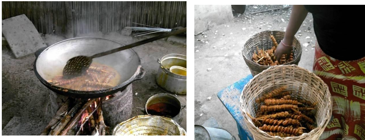
Figure 5 .Frying of skewered clams and batch of fried clams ready for sale

The most valuable part of the clam is the meat which is a delicacy and is processed and sold at major roadside stop-overs. The processing method is simple and involves initial boiling to open the shells after which the meat is taken out and washed to remove sand particles. It is then skewered and fried (Figure 5). The main locations for the sale of fried clams are along the major highways in south-eastern parts of Ghana at Atimpoku on the Accra-Ho Highway and at Kasseh and Sogakope on the Accra-Aflao Highway. Clam processors obtain their supply from fishers at two landing beaches at Agave-Afedome and Big Ada.