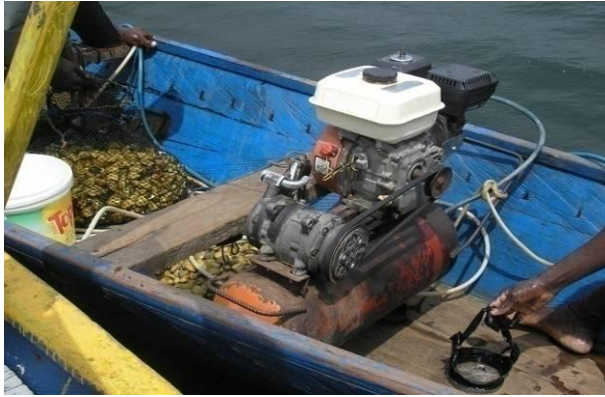
Fig 4A. A motorized air compressor