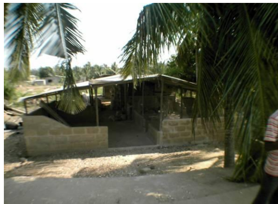
Fig 6D. A clam shell mill at Sogakope