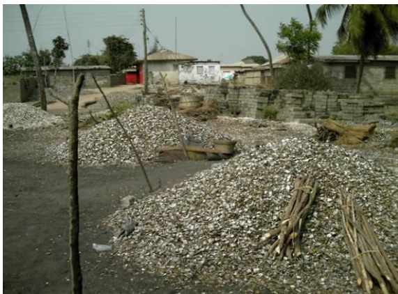
Fig 6C. Heaps of shells at Big Ada